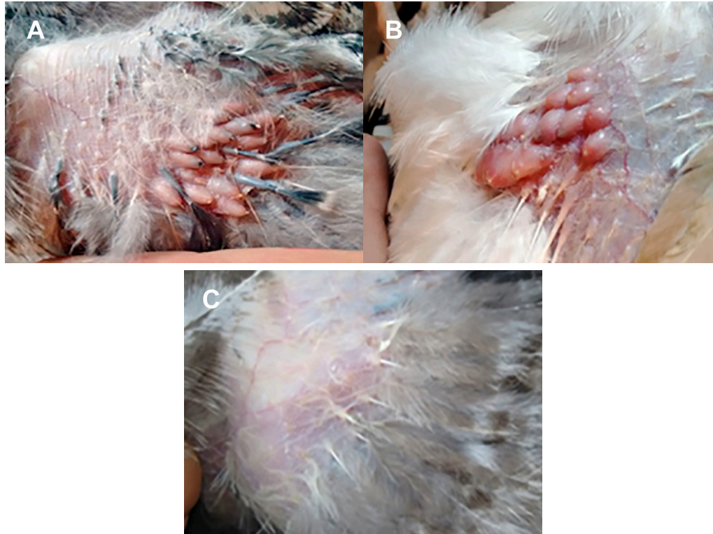
Figure 3. Photographs of the thigh region of eight-week-old turkey chicks from the three treatment groups after being challenged through an excoriation with a turkeypoxvirus isolate. A) Control. B) Heterologous vaccine. C) Homologous vaccine. Lesions consistent with a pox infection can be seen in A and B. No post-challenge lesions are observed in photograph C.

Turkeypox virus strain TKPV-HU1124/2011, complete genome Sequence ID: KP728110.2 Length: 188534 Number of Matches: 1