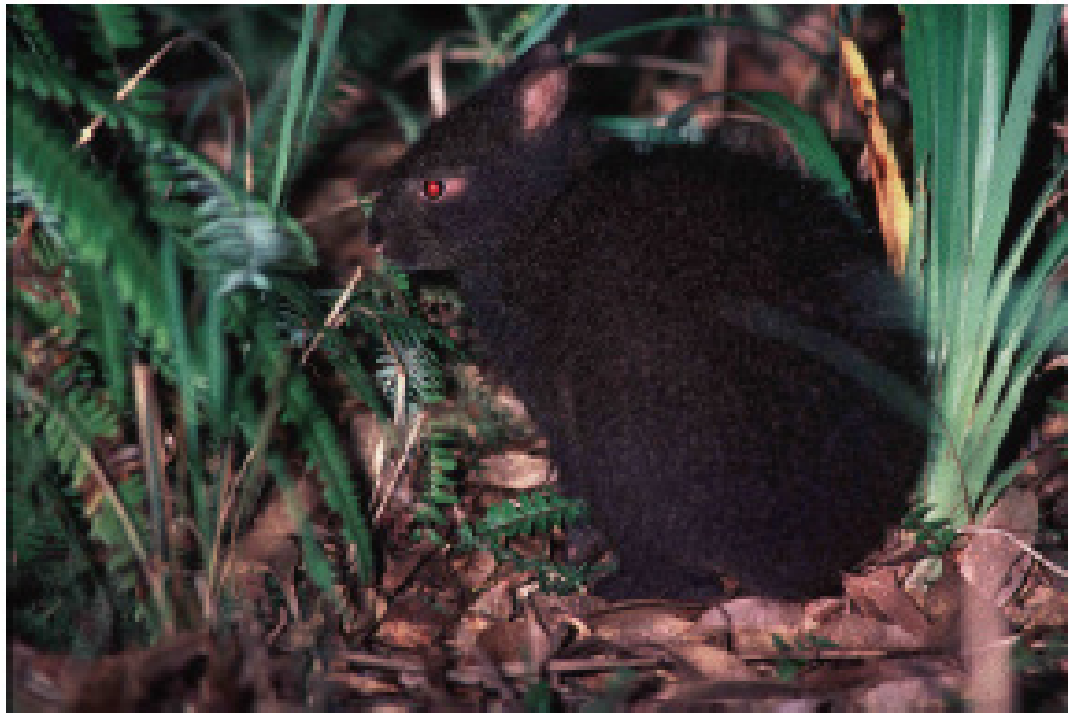
Figure 3. The Amami rabbit Pentalagus furnessi (Stone, 1900) on Amami-ohshima Island.

The Amami rabbit is a primitive, short-eared rabbit which is endemic to Japan and that has evolved in an insular environment without native mammalian predators (Figure 3; Yamada and Cervantes 2005; Yamada 2008, 2009). It is distributed only on two small islands (Amami-ohshima Isl. and Tokuno-Shima Island) in Kagoshima Prefecture located in southern Japan. Using fecal pellet counts and resident surveys, the number of rabbits is estimated at 2000 to 4800 on Amami-ohshima Isl. in 2003 and 100 to 200 on Tokuno-Shima Island in 2004 (Sugimura and Yamada 2004). The size of its distributional range, as estimated by fecal pellet counts during 1992 to 1994, is 370.28 km 2 (52 % of the Island) on Amami-ohshima Isl. and 32.97 km 2 (13 %) on Tokuno-shima Island. This represents a 20 to 40 % decline in the area inhabited on Amami-ohshima Island in 1992 to 1994 compared to that estimated in 1974 and 1977 (Yamada 2009). In 1921, the Japanese government assigned the Amami rabbit to “natural monument” status which prevented it from being hunted. Then in 1963, it was changed to a “special natural monument” which prevented it from being hunted and trapped, as well. MOE designated the Amami rabbit as a National Endangered Species in 2004.