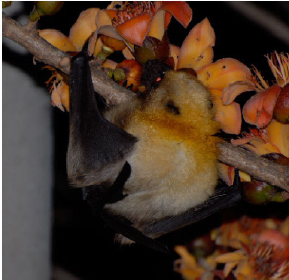
Figure 5. A male Daito flying fox ( Pteropus dasymallus daitoensis Kuroda, 1921) feeding on the nectar of the red silk-cotton tree; photographed by Masako Izawa.

Threats for the flying foxes are habitat destruction such as deforestation, disturbance of roosting sites by tourism, and predation by alien predators such as domestic cats. Especially for the Bonin flying fox, which forms permanent colonies and tends to use fixed roosting sites (Sugita et al. 2009), human disturbance to these roosting sites is a serious threat. Additionally, these bats conflict with farmers for commercial fruits. Although farmers do not kill flying foxes directly, they are accidentally killed by orchard nets which farmers set to prevent birds and flying foxes from accessing fruit crops.