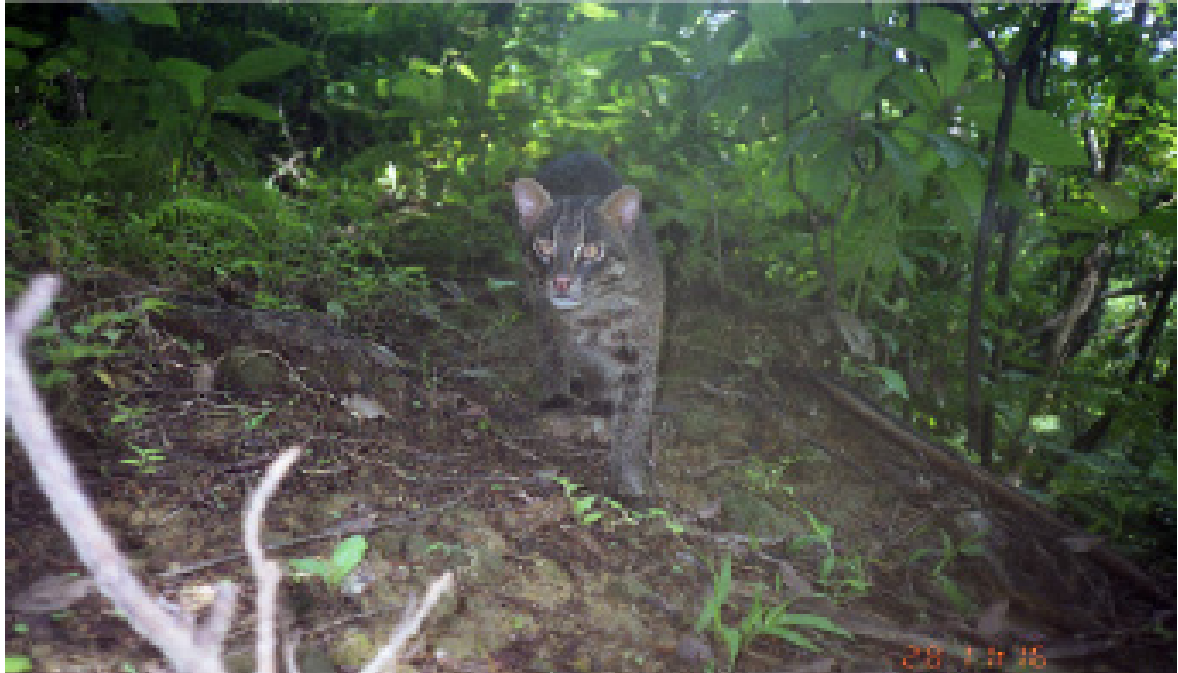
Figure 4. An Iriomote cat Prionailurus bengalensis iriomotensis (Imaizumi, 1967) walking in the subtropical forest of Iriomotejima Island.

Other threats are derived from invasive animals: predation by dogs, competition with feral cats (Watanabe et al. 2003), and the spread of diseases such as Feline immunodeficiency virus from domestic cats (Nishimura et al. 1999).