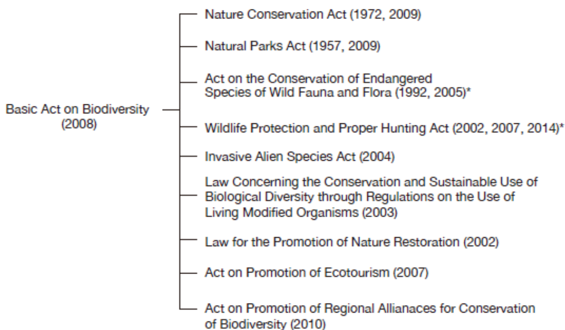
Figure 2. The structure of Japanese laws on biodiversity. Basic Act defines the fundamental policy of the Japanese government for conserving biodiversity. Practical policies and strategies are described in the 9 specific acts. Asterisks show the Acts that are highlighted in this study.

http://www.japaneselawtranslation.go.jp . This act is aimed at ensuring the conservation of endangered species of wild fauna and flora, and requests the national government to monitor the status of wild fauna and flora species as well as to formulate and implement comprehensive measures for the conservation of endangered species. Local governments have also responsibility to formulate and implement measures for their conservation. This endangered species legislation is designated by Cabinet Order, and prohibits in principle the taking, transferring, or displaying of species so designated. The Minister of the Ministry of Environment (MOE) may designate, as “natural habitat protection area”, the habitat of particular species and the area that needs to be protected. It also establishes a program for the rehabilitation of natural habitats and maintenance of viable populations. However, when applying this Act, ownership and any other property rights must be respected.