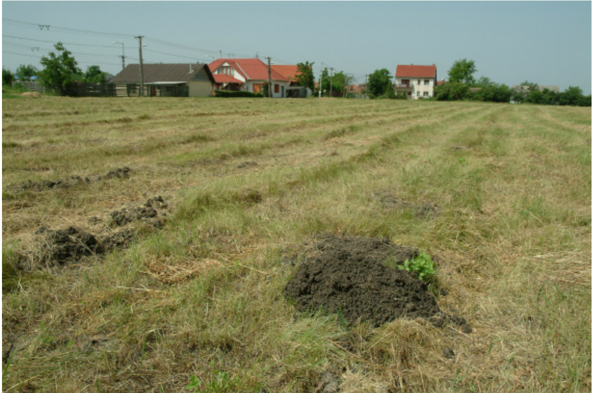
Figure 5. In many cases, property development poses imminent threat to the remaining population fragments (Mezőtúr, Hungary).

our times is property development, the construction of new suburbs, industrial parks, solar panel parks, shopping malls, parking lots, and other types of built-up areas. In Hungary, some blind mole-rat populations can be found within settlements (Figure 5). Most of the land in these cases is the property of the municipality and impending industrial investments can mean complete eradication (Krivek 2014; Sendula 2014). A Serbian population inhabits a popular vacation resort, where actual and planned development projects may result in losing the entire population (Németh et al. 2013c; Krivek 2014). Road construction can also annihilate populations. This is an omnipresent risk factor in all countries of the region that mainly concerns non-protected areas. In Hungary, one subpopulation disappeared due to the construction of a new highway exit (Németh et al. 2013c).