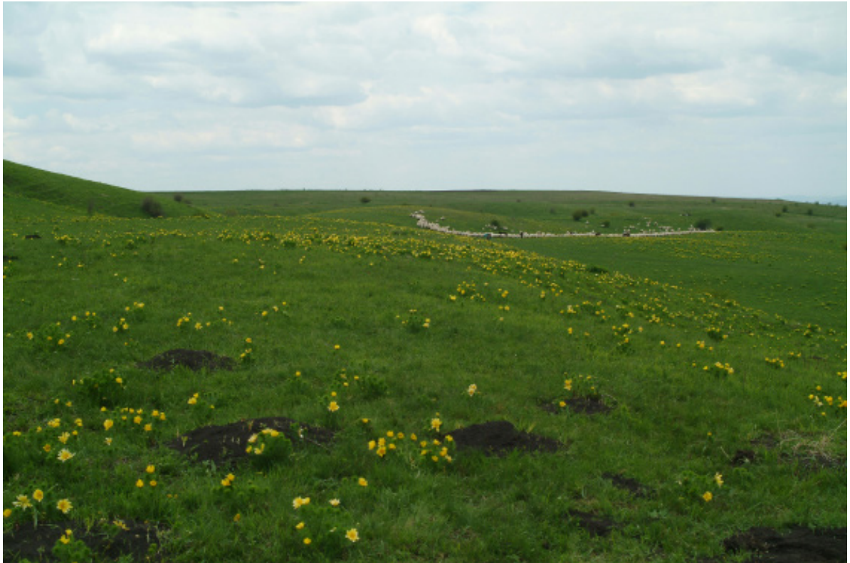
Figure 4. Vast, dry grasslands are the typical habitats of blind mole-rats (Aiton, Romania)

The very first and most rapid changes in habitat structure took place in Hungary between the second half of the 1950s and the 1970s. A similar progression started in Transylvania at the same time, however on less extensive areas, owing to the scarcity of vast plain areas adequate for large-scale agriculture. Grassland habitats of Vojvodina were affected in the 1990s. As a consequence of habitat deterioration blind mole-rat populations retreated to remnant grassland fragments and became completely isolated from each other. Recent regional development and urbanisation had particularly adverse impacts on the remaining blind mole-rat populations of Hungary and Vojvodina (Németh et al 2013c; Krivek 2014; Sendula 2014). In the early 2000s only five populations in Hungary and two in Vojvodina were recorded (Horváth and Vadnai 2006; Delić 2007), and there was no information on either the localities or the size of mole-rat populations in Transylvania.