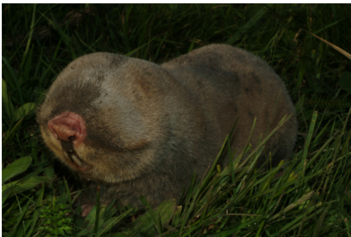
Figure 1. Spalax antiquus (Aiton, Romania) in its natural habitat.

Lesser blind mole-rat, Nannospalax (superspecies leucodon ; Musser and Carleton 2005). Although the species status of taxa differentiated solely on chromosomal grounds has not been widely accepted (Sözen et al. 2006; Ivanitskaya et al. 2008; Kryštufek et al. 2012), the results of the until now fairly limited molecular genetic investigations of this superspecies (Hadid et al. 2012; Németh et al. 2013a) and the results of breeding experiments with several Central European and Balkan chromosomal forms (Savić and Soldatović 1984) raises the necessity of species level separation at least of some of them. Alongside with taxonomic uncertainty the determination of conservation status of different mole-rat taxa is further hampered by their exclusively subterranean lifestyle which makes it difficult to evaluate their population size. While the leucodon -superspecies itself was categorised for a long time as Least Concern (Temple and Terry 2007, 2009), and changed recently to “Data Deficient” (Kryštufek and Amori 2008) to express the systematic problems within the group, while populations and habitats of many different European chromosomal taxa are disappearing at an alarming rate, a phenomenon which has just recently been realized (Kryštufek 1999; Kryštufek and Amori 2008; Németh et al. 2009).