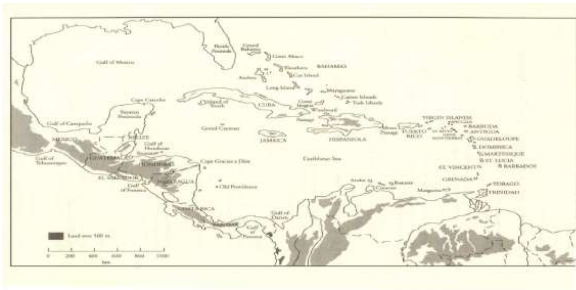
Fig. 1 Map of the Circum-Caribbean Area (copied from Palacio 2005:8, courtesy of Cubola Press).

small, kinship based rural communities. The longevity of Garifuna culture as we know it has been due to its incubation within small villages all along the coast of Central America for the better part of the last 200 years.