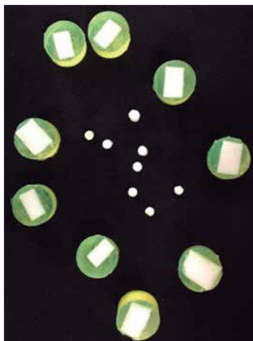
Figure 5. Ketac Cem, 3M™ ESPE™ glass ionomer.

Bonding agents have been developed in recent years. They have been introduced to improve bonding strength of ceramic to zirconium. When using RelyX® Elite and Multilink® Automix, the manufacturer recommends, in an alternative manner, to use systems with imprinters or bonding agent Single