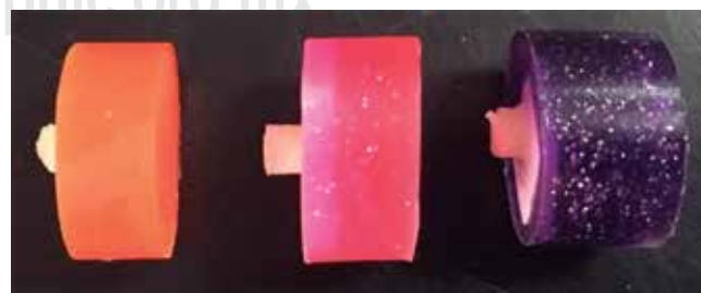
Figure 3. Samples of all three resin cements.

Ketac Cem (3M™ ESPE™) glass ionomer samples were discarded, since during manufacturing, all 10 samples failed ( Figure 5 ).