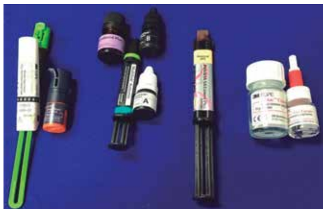
Figure 2. Cements used in the study.

Forty 7 x 7 mm square samples of Zirconia Lava™ Plus, 3M™ ESPE™ were obtained. They were sintered at 1,450 °C for 8 hours, according to manufacturer's instructions in an oven program S1P1600, Ivoclar Vivadent.