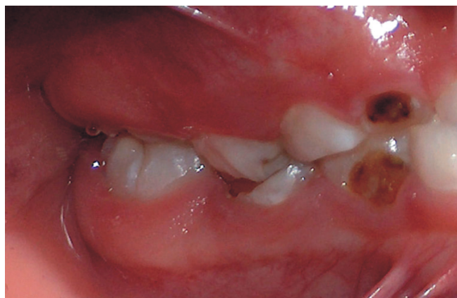
Figure 1. Right lateral intraoral picture. Multiple carious lesions and distal step can be observed.

Salt-loss CAH refers to a group of inherited disorders of the adrenal glands, characterized by a deficiency of the hormones cortisol and aldosterone and an overproduction of androgen; it is an autosomal recessive disease. Female patients present sexual ambiguity and male patients a high virilization. 8