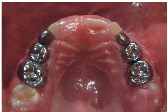
Figure 5. Upper occlusal picture. (Follow up) stainless steel crown restorations can be seen.