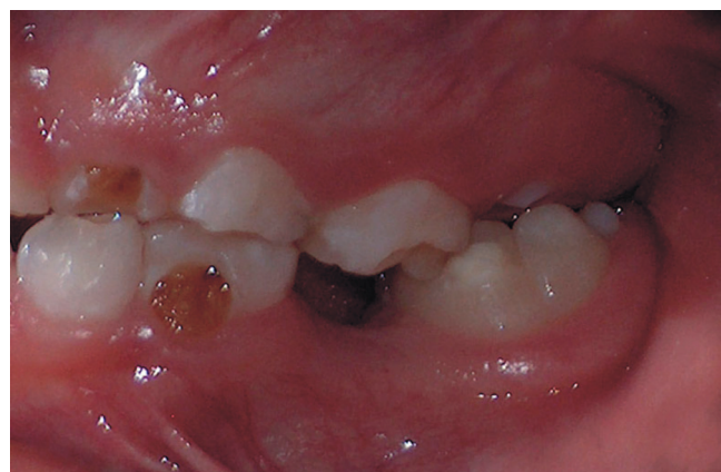
Figure 2. Left lateral intraoral photograph: Occlusion can not be evaluated due to the absence of 75 and 26 is still erupting.