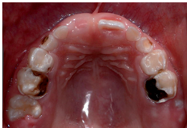
Figure 3. Intraoral upper picture multiple lesions of diverse carious degrees can be observed. Too 11 is missing.