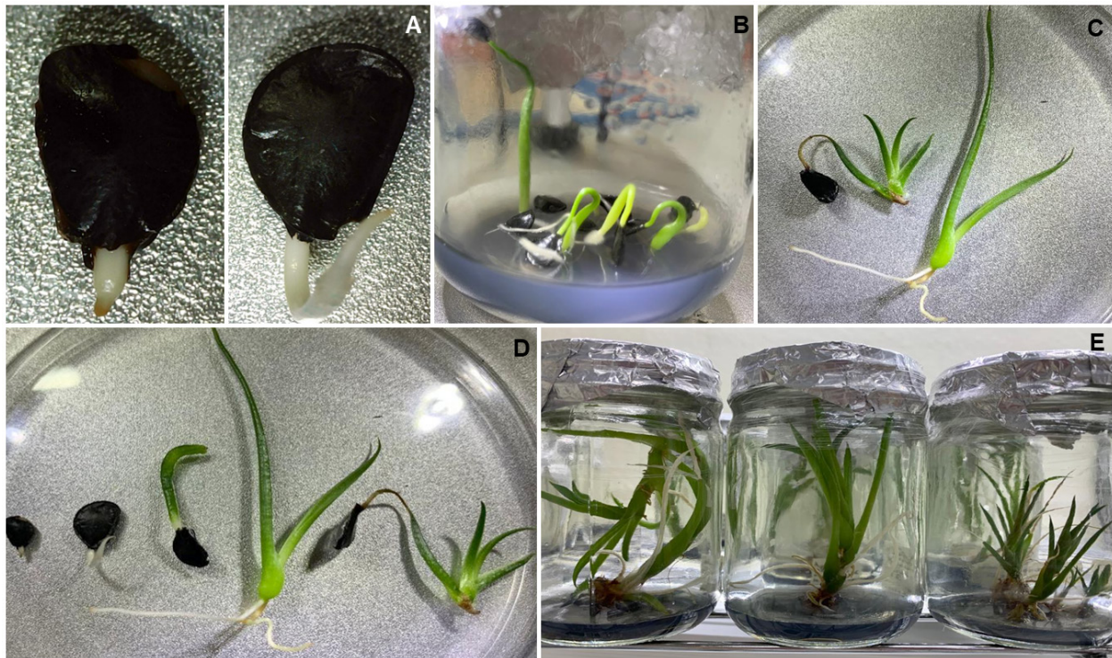
Figure 1. A. salmiana seed germination. A) root emergence and elongation. (14 dap) B) Elongation of the plumule. (21 dap) C) Diferenciación of the root cotyledons and development. (30 dap) D) Full germination and development. (14-30 dap) E) Normal, completely developed A. salmiana seedlings. (50 dap); dap days after planting.