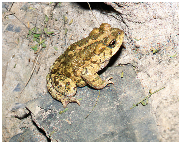
Figura 3. Incilius occidentalis , MZFC 6536, an adult male from 2 km East of Río Estórax, Peña Miller, Querétaro, Mexico, collected by Oscar Flores-Villela in October 12, 1993 (Photograph: O. Flores-Villela).

color pattern and granulation of dorsal surfaces, including dark brown bands bordered by lighter lines with a light mid-dorsal line in I. tacanensis , characters not present in I. occidentalis , moreover, a line of small conic granules runs along the flanks in I. tacanensis .