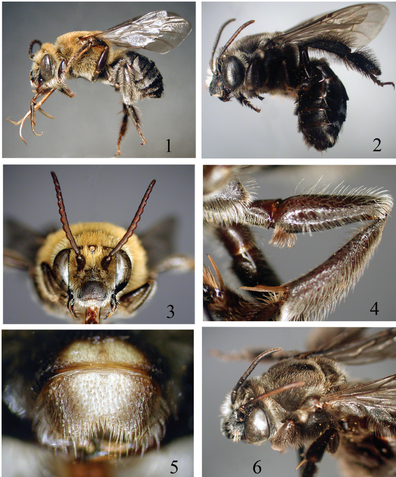
Figures 1-6. Peponapis pacifica sp. n. 1, male in lateral view; 2, female in lateral view; 3, frontal view of male, showing crenulate antennae; 4, hind leg of male, showing tuft of setose hairs on femur basoventrally; 5, labrum of female with concave distal margin and yellow maculation, and 6, dorsal view of mesosoma of female.