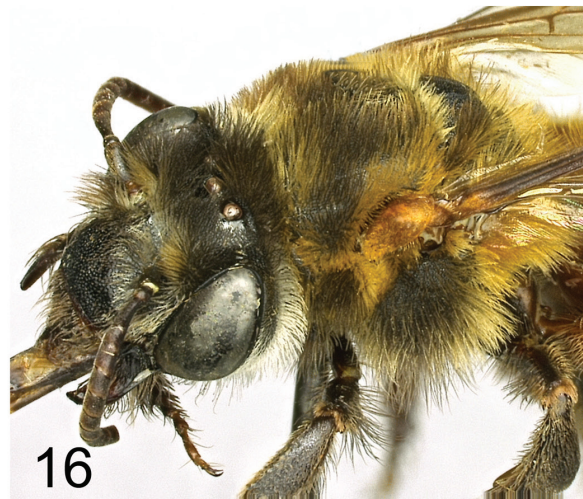
Figures 11-16. Peponapis parkeri sp. n. 11, male in lateral view; 12, female in lateral view; 13, frontal view of male; 14, hind leg of male; 15, T1 of the female; 16, dorsal view of mesosoma of female.