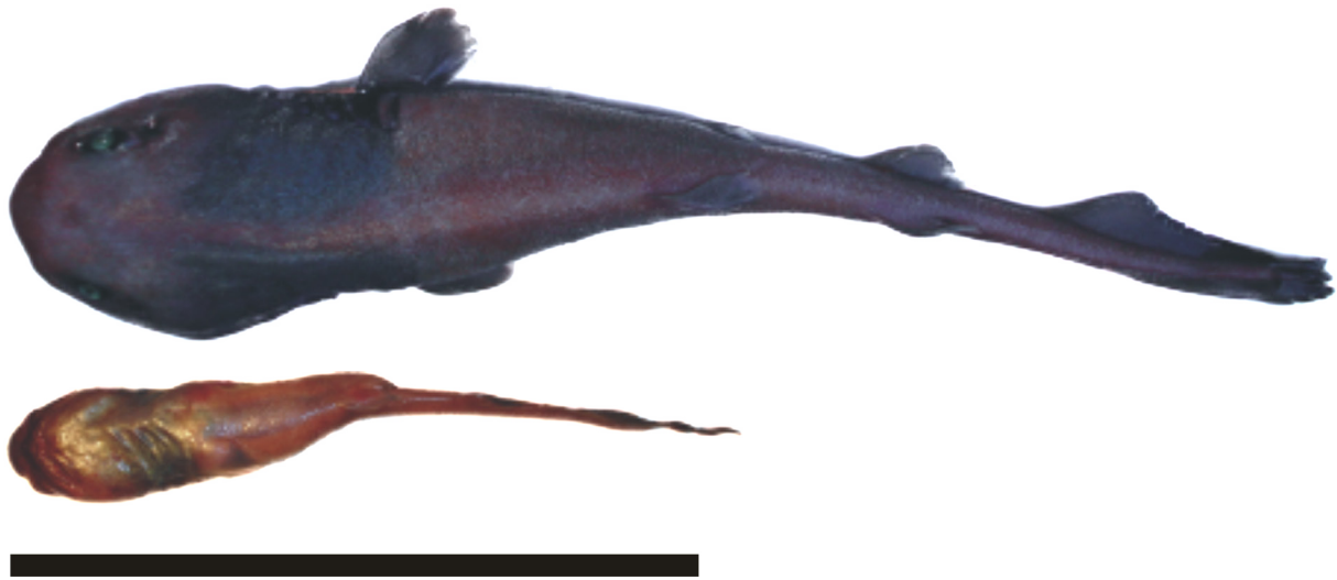
Figure 1. Specimens of the lollipop catshark Cephalurus cephalus caught in the Gulf of California (Talud X, St. 12). a), dorsal view of a female 221 mm TL. b), ventral view of a female neonate 107 mm TL. Bar= 100 mm.

The lollipop catsharks were caught at a depth range of 464 to 486 m and at a temperature of 9.4°C, and where hypoxic (0.14 ml/l) conditions prevailed. In the south-eastern Gulf of California, epibenthic dissolved oxygen concentration is always <0.5ml/l and occasionally <0.1 ml/l, limiting the occurrence of macroinvertebrate species that cannot tolerate severe hypoxic conditions (Hendrickx 2001, 2003). However, for C. cephalus this does not repre-