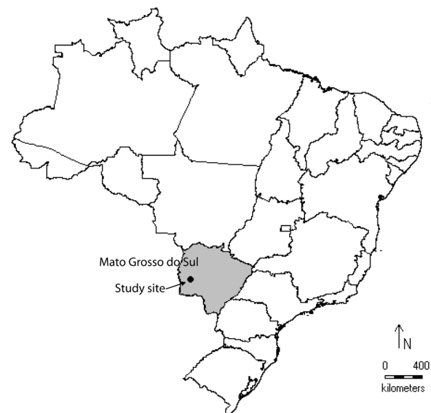
Figure 1. Study site localization, Parque Nacional da Serra da Bodoquena, Mato Grosso do Sul, Brazil.

We identified prey items to order level, under a stereoscopic microscope, using Borror and DeLong (1988) as reference. All larvae were considered a single resource; spiders and scorpions were grouped in Arachnidae. We calculated numeric and volumetric percentages of the food items. We estimated volume by the parallelepiped formula using a millimetered plaque (Hellawell and Abel, 1971). For each stomach sample, we grouped all items of the same category and used the total volume. For example, in each stomach, all the formicids were combined and the total volume was