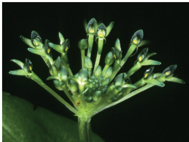
Figure 1. Inflorescence of Malaxis rzedowskiana (from a plant from Guerrero, Mexico: Salazar et al. 6437 , MEXU).