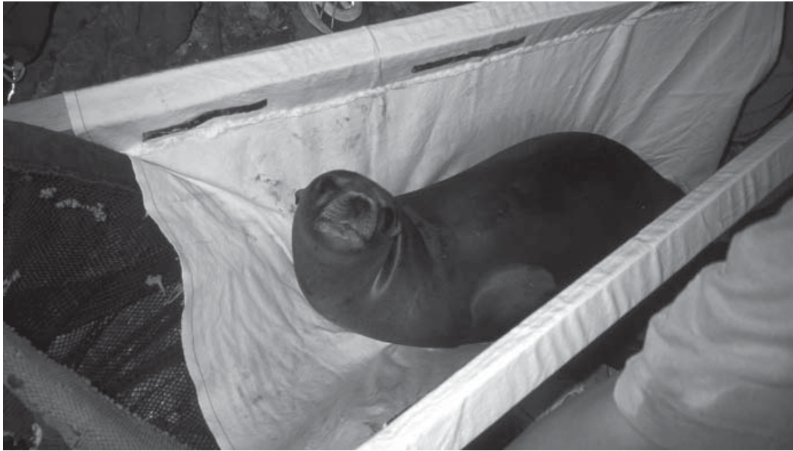
Figure 2. Sea lion pup inside the open stretcher, prior to wrapping.