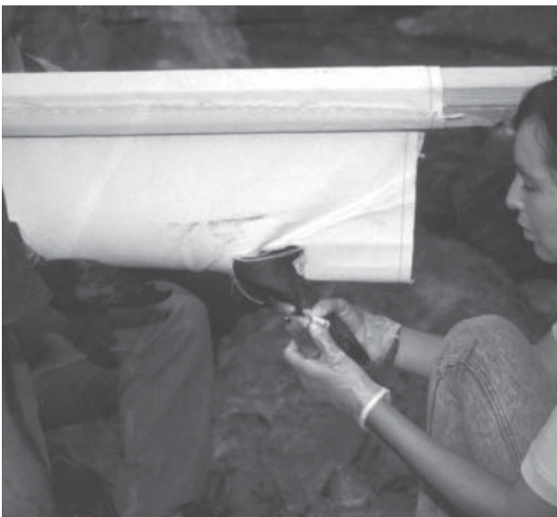
Figure 3. General view of the stretcher during blood sampling from the left hind limb.