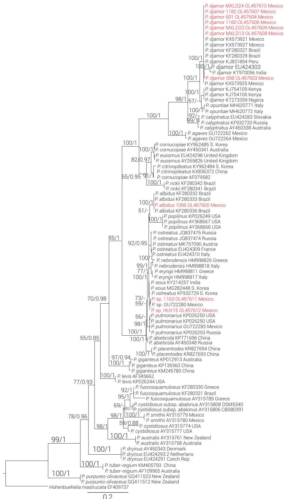
Figure 1. Maximum likelihood phylogram of Pleurotus produced from ITS sequence data. ML bootstrap values (BS) greater than 50 % and Bayesian posterior probabilities (PP) greater than 0.9 are shown above and below the branches (BS/PP), respectively. The strains from this study are shown in red.