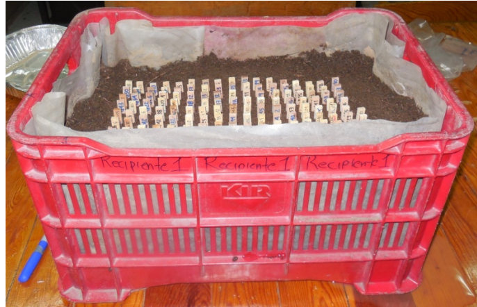
Figure 1. Test specimens exposed to the soil microcosm.