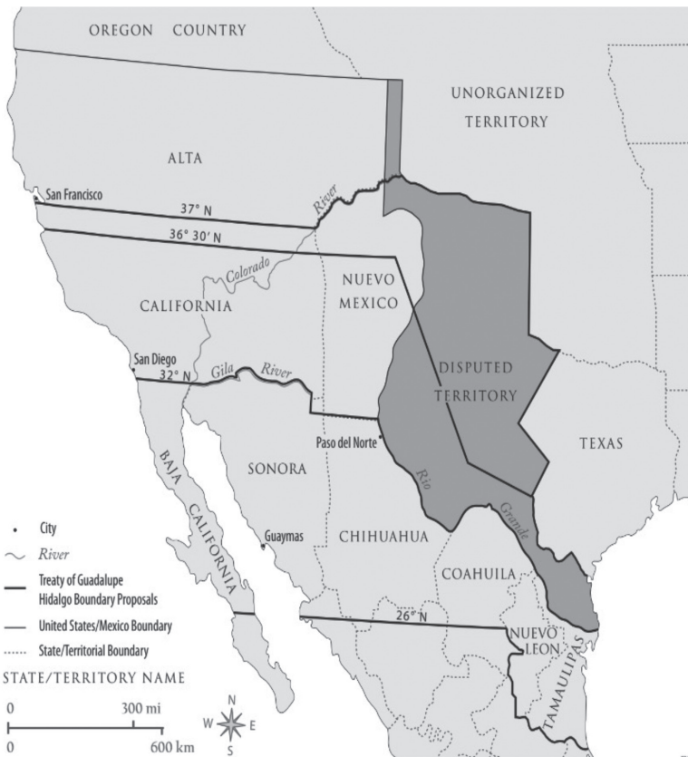
Figure 1 MAP BY EZRA ZEITLER SHOWING SOME OF THE BORDERS CONSIDERED DURING THE NEGOTIATIONS OF THE TREATY OF GUADALUPE-HIDALGO