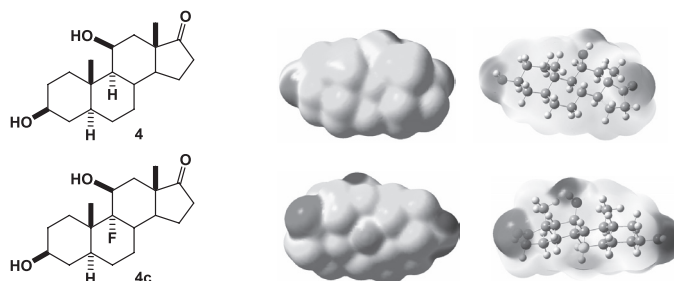
Figure 1. Variation of the electronic density of the hydroxyl group at C-11.