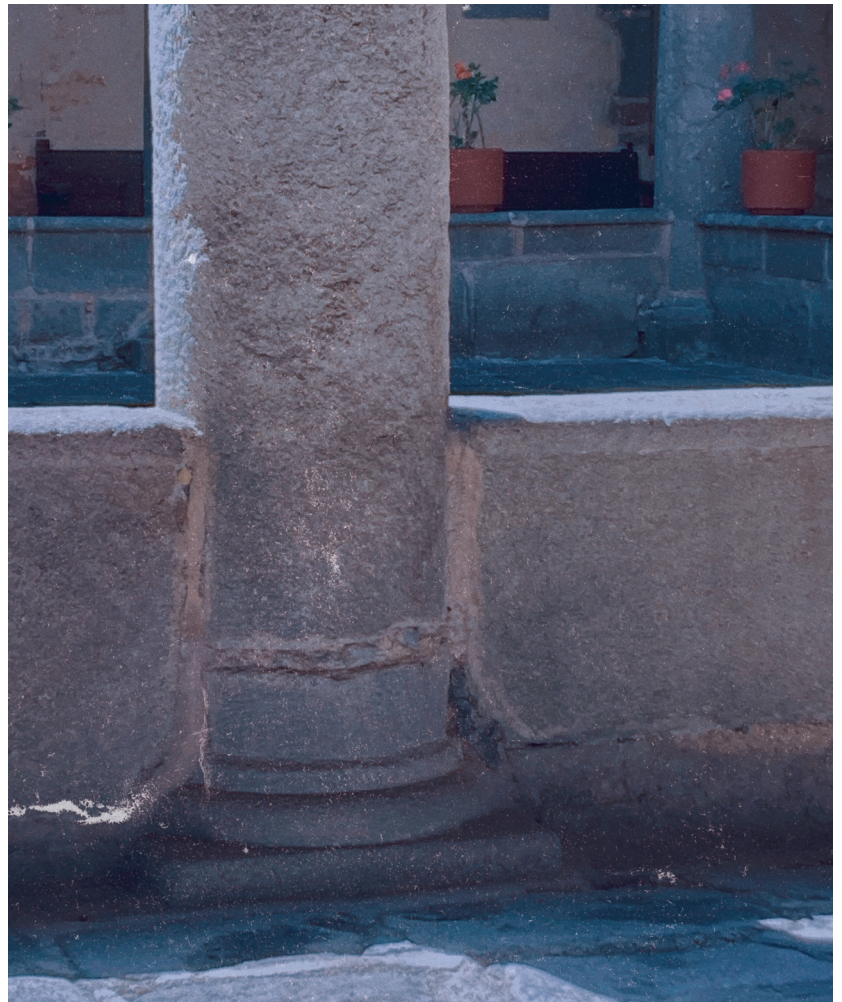
FIGURE 3. Details of the architecture of the viceregal museum.