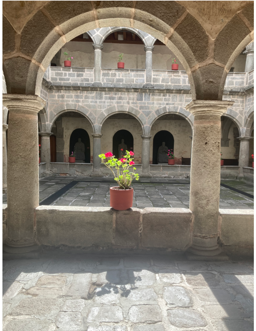
FIGURE 5. Visit to the Zinacantepec Senior Citizens' Home.