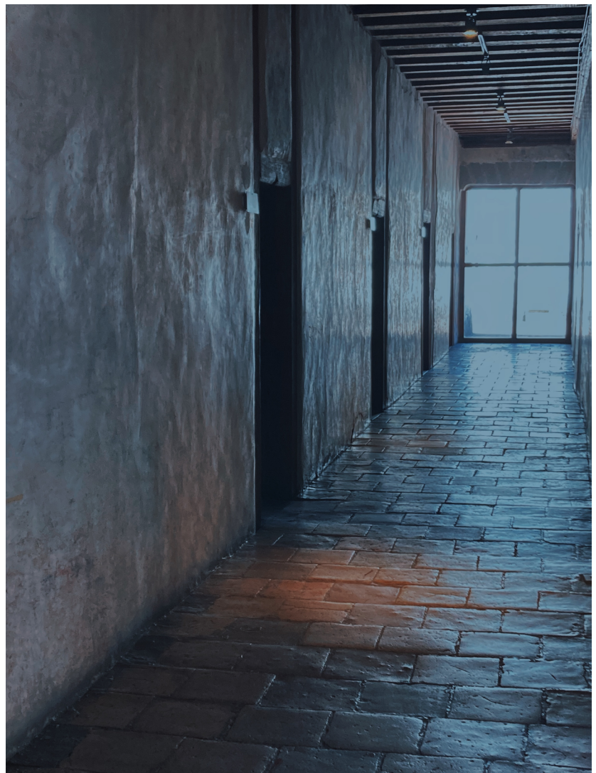
FIGURE 1. Hallway of the Viceregal Museum of Zinacantepec.

In these cases, the appreciation and emotional connection that could emerge from experiencing a historical building in the present are relegated to the background, as the priority—far from highlighting the building’s technical or aesthetic qualities—is to immerse the public in the represented historical period.