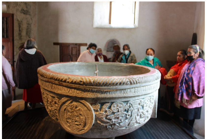
FIGURE 2. View of the Zinacantepec Senior Citizens' Home (Photograph: Diana Ricárdez, 2022; courtesy: Zinacantepec Viceregal Museum).

A notable aspect of the activity was that the staff of the Senior Citizens' Home was unaware of many of the shared stories. This finding highlights the importance of preserving and processing this kind of information to give voice to the subjectivity of the individuals who interact with the museum. Incorporating these personal stories into the museum discourse not only broadens and adds complexity to the official narratives but also transforms the museum into an inclusive and dynamic space, capable of resonating with the diversity of experiences and perspectives within its community.