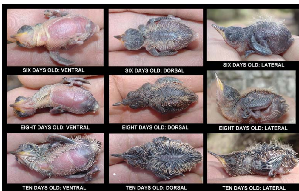
Figure 3. Nestlings of Black-chinned Hummingbird ( Archilochus alexandri ) 6-10 days old, at the Southwest Research Station, Portal, Arizona, USA, showing feather development. Note that exposures vary so that true color may not be properly represented.