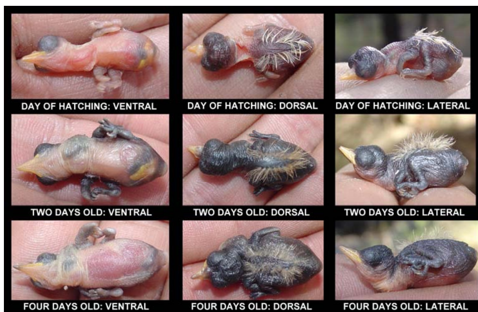
Figure 2. Nestlings of Black-chinned Hummingbird ( Archilochus alexandri ) 0-4 days old, at the Southwest Research Station, Portal, Arizona, USA, showing feather development. Note that exposures vary so that true color may not be properly represented.

will be more important in determining fitness. It would be informative for future studies to report this behavior in other hummingbird species.