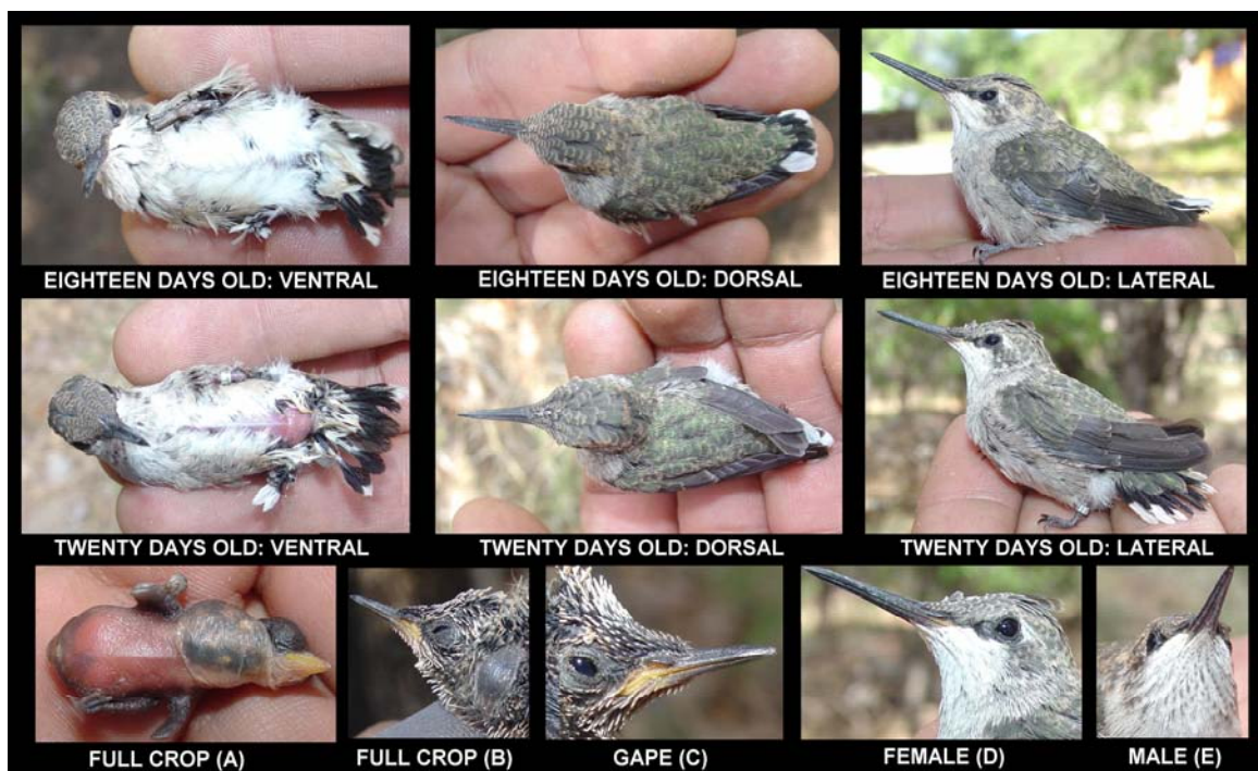
Figure 5. Nestlings of Black-chinned Hummingbird ( Archilochus alexandri ) 18-20 days old, at the Southwest Research Station, Portal, Arizona, USA, showing feather development. Note that exposures vary so that true color may not be properly represented. Additional photos include A) ventral view of a young nestling showing engorged crop; B) mid-aged nestling showing full crop; C) mid-aged nestling showing yellow gape flanges; D) 20 day old female nestling showing immaculate white throat; E) 20 day old male nestling showing faint scaling on throat.