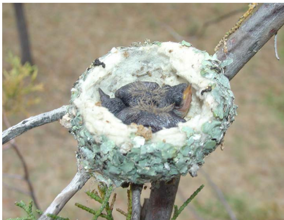
Figure 6. Young nestlings of Black-chinned Hummingbird ( Archilochus alexandri ), at the Southwest Research Station, Portal, Arizona, USA, showing typical resting position in the nest during the first half of the nestling period.