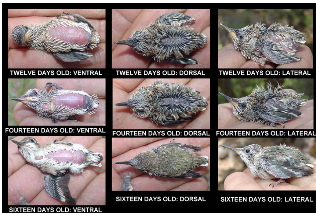
Figure 4. Nestlings of Black-chinned Hummingbird ( Archilochus alexandri ) 12-16 days old, at the Southwest Research Station, Portal, Arizona, USA, showing feather development. Note that exposures vary so that true color may not be properly represented.