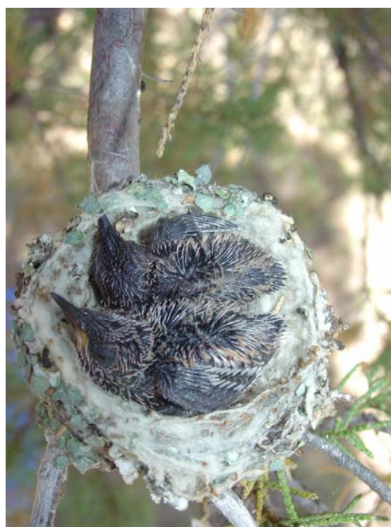
Figure 7. Older nestlings of Black-chinned Hummingbird ( Archilochus alexandri ), at the Southwest Research Station, Portal, Arizona, USA, showing typical resting position in the nest during the second half of the nestling period.