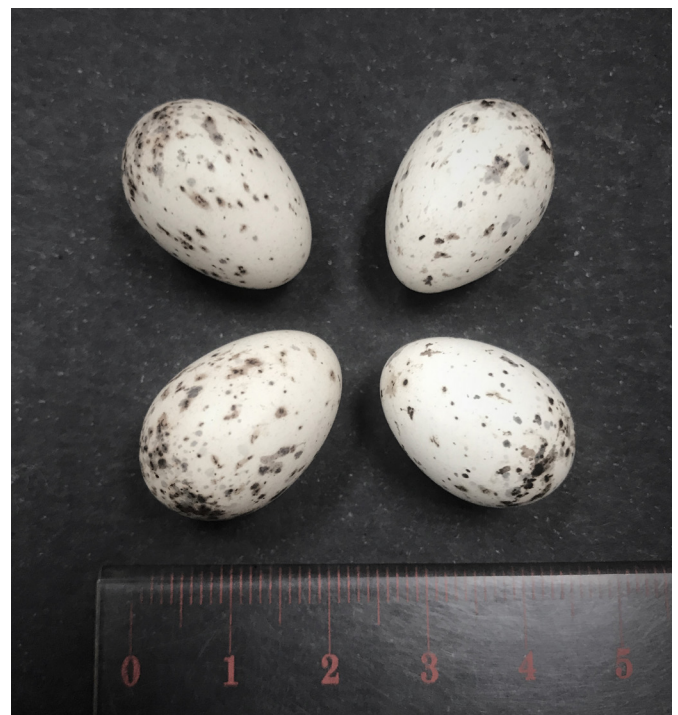
Figure 3. Alleged clutch of the Gray-barred Wren ( Campylorhynchus megalopterus ) in the Western Foundation of Vertebrate Zoology (WFVZ catalogue number EN-145380), collected by Fred B. Nyc Jr on 12 May 1956, one-mile SE of the Aborado road, in Veracruz, Mexico.