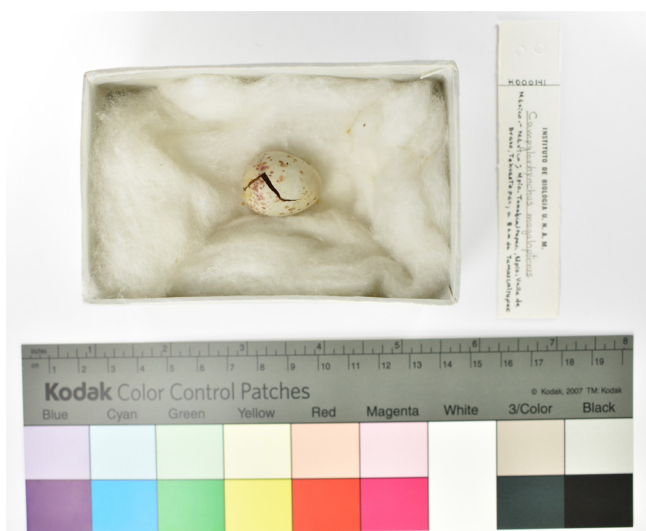
Figure 2. The only known egg of the Gray-barred Wren ( Campylorhynchus megalopterus ) collected by Moisés Sanchez in Temascaltepec on the 18 August 1983, preserved in the Colección Nacional de Aves of the Instituto de Biología, Universidad Nacional Autónoma de México (CNAV catalogue number 004917, IBUNAM label number H000141).

collecting nest material and feeding chicks on 24 March 2024 (Table 1). This suggests that eggs and chicks may be produced early in the season, or that multiple broods may be produced, as is known to occur in other Campylorhynchus taxa (Brewer 2001).