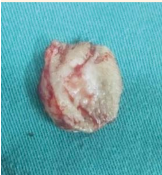
Figure 2. Surgical specimen.