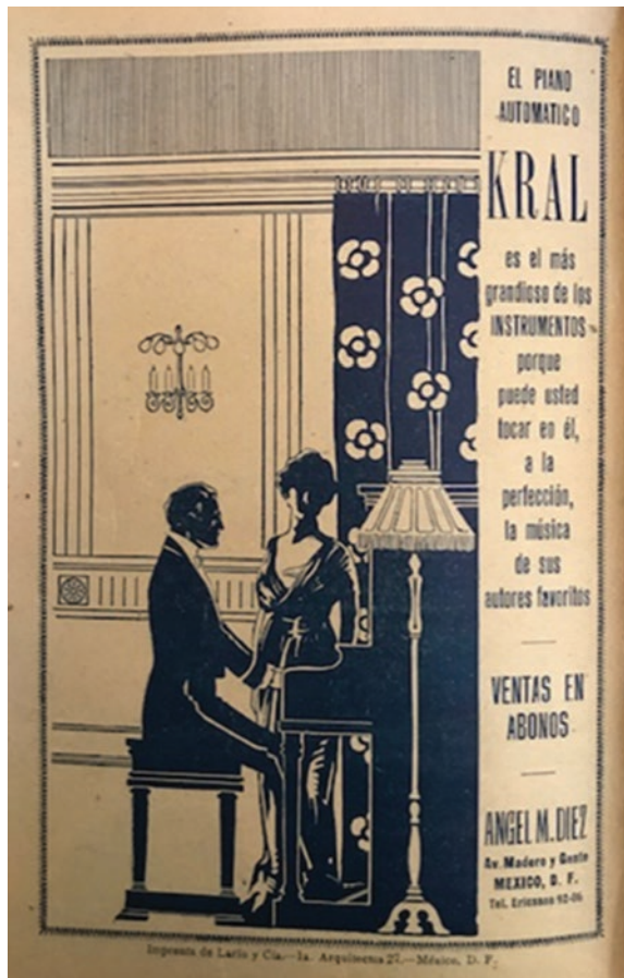
Figure 4. In 1921, Gaceta Médica de México inserted advertising in its pages.