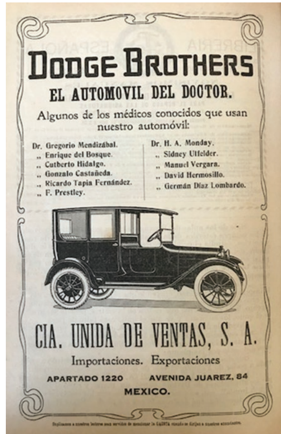
Figure 3. In 1921, Gaceta Médica de México advertised a brand of automobiles to collect funds.