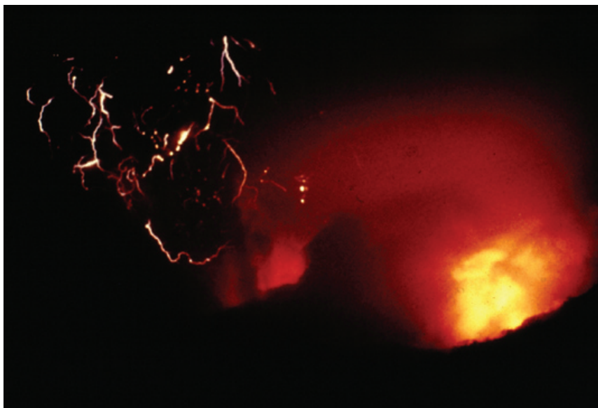
Fig. 8. Active pyroclastic flow generated during the plinian phase of the April 3, 1982 El Chichón eruption.

column made us realize that we were witnessing a major eruption. About 20 minutes later, we could see a glowing cloud (Fig. 8) heading our way, slightly to our right. It took a moment to realize that it was a pyroclastic flow. We knew that we were standing at about 11 km from the volcano, but in the darkness and the confusion induced by the heavy pumice fall, it was very difficult to determine the extent of the pyroclastic flow. We returned to the small house that was the Ostuacán City Hall, where the army had setup a headquarters, and discussed the situation with the officer in charge. He instructed his communications officer to contact the main headquarters at Pichucalco by radio. The officer unsuccessfully tried for a long time to contact any other army group. It seems that the static electricity within the volcanic cloud prevented any radio communication.