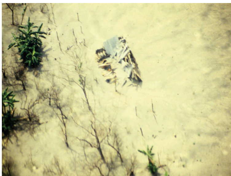
Fig. 9. House near El Naranjo, a small village located about 9.5 km to the south of the crater which was destroyed by pyroclastic surges.

From many studies made after 1982, the eruptive history of El Chichón is now well known and its volcanic hazards evaluated. Both federal and state Civil Protection agencies now are aware of the volcano risk and additional monitoring is being implemented at the volcano. A permanent telemetred seismic station has been set up near the crater, and two more broad-band stations are to be installed soon at Nicapa and Francisco León (C. Valdés, personal comm.). A 6-vertices EDM baseline geodetic network complemented with 2 GPS reference points has also been set up around the crater, and systematic sampling of the crater lake water has been underway since 1983 (Armienta et al. , 2000). The volcanic crisis situations are assessed by appointed scientific committees, where all opinions are discussed collectively and provided to the authorities. Currently, a national Scientific Committee for Geological Risk, appointed by the Ministry of the Interior meets at least once a year, or more frequently if necessary at the National Center for Disaster Prevention (CENAPRED). Locally, a new ruling for the Civil Protection System of the state of Chiapas, foresees appointment of a new State Scientific Committee in 2009. This new structure includes a program to install additional seismic, geodetic and geochemical monitoring at El Chichón and Tacaná volcanoes.