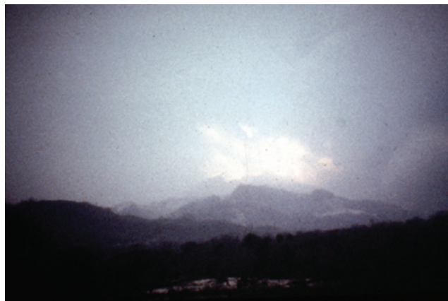
Fig. 7. Initial explosion of the plinian eruption of April 3, 1982