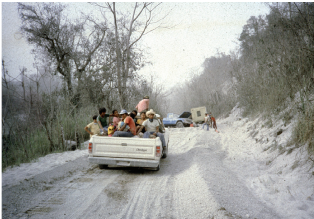
Fig 5. Traffic jam in an ash-covered secondary road. Two-way traffic became impossible due to the number of broken-down cars along such roads.

Throughout the week of the eruption thousands were evacuated, first disorderly and then in a more organized way after the DN3 plan started operating. The evacuees were transported mostly to the neighboring state of Tabasco. First 29 shelters were installed in schools, and 8 more later were implemented in different cities. The DN-III-E plan evacuated a total of 22352 persons (DN-III-E, 1983).