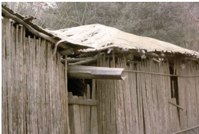
Fig. 6. Weak constructions damaged by ash fall and ballistic impacts.