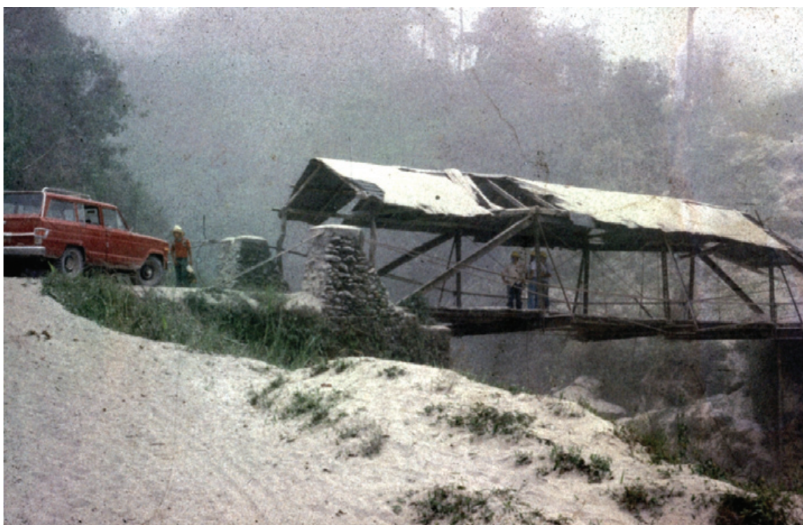
Fig. 3. Wooden bridge about 6 km from the volcano, partially destroyed by fall products of the March 28, 1982 El Chichón eruption (photo by S. De la Cruz-Reyna).

Under these conditions, the UNAM group could not organize a single mission, and the group separated in smaller groups of two or three scientists and graduate students that traveled to the regions beginning on March 29 according to the available transportation. Petróleos Mexicanos (PEMEX), the national oil company, offered several vehicles to transport the scientists and the equipment southeastward since their DC-3 airplane could not get closer than the city of Veracruz because the ash clouds had forced the closing of the air space in southeastern Mexico.