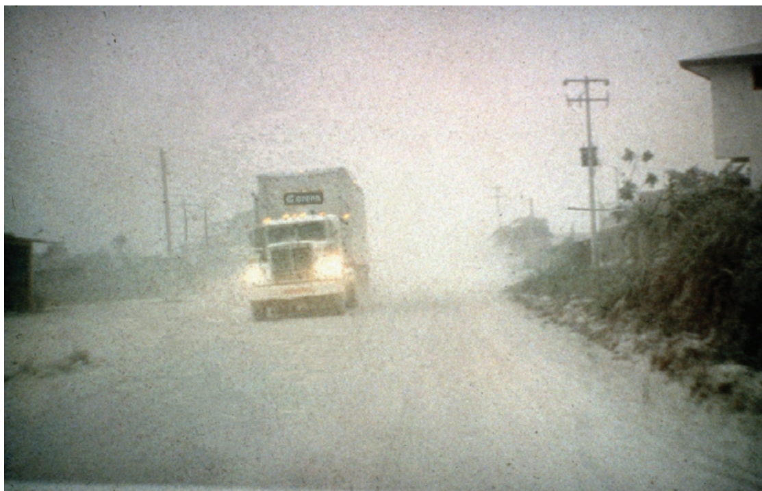
Fig. 4. Ash fall on a road between Coatzacoalcas and Villahermosa, March 29, 1982.

It was, however, evident from looking at the seismograms during the first days of the seismic network operation that the eruption had not ended. Even though during the first hours of 30 March the seismograms showed an almost complete seismic quiescence, large-amplitude tremors mixed with LP earthquakes began at about 07:15 of that day (Jiménez et al. , 1999). Even cursory examination of the seismograms during the paper-change and lacquer fixing routine, and afterwards, in the