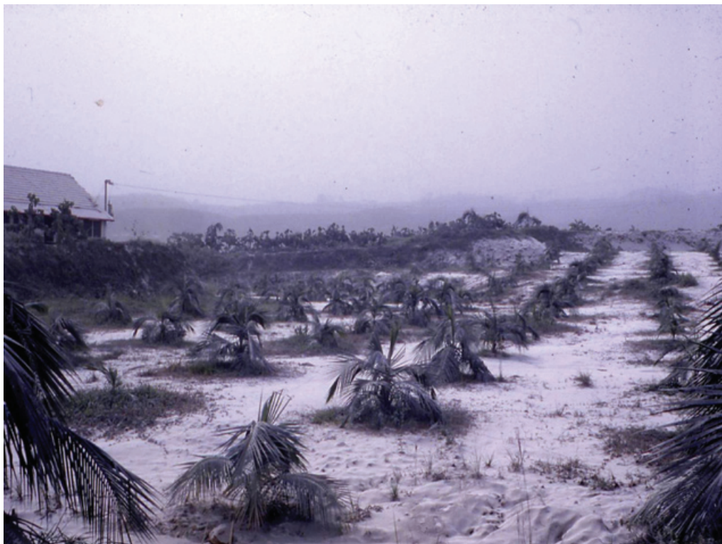
Fig. 2. Damage to small palm trees caused by the ashfall of the March 28, 1982 eruption.

km south of the volcano), indicated that the eruption onset was preceded by at least one month of intense shallow seismicity (Havskov et al. , 1983; Jiménez et al. , 1999). Precursory earthquakes occurred earlier, since inhabitants of the area reported felt earthquakes throughout 1981 that seemed to increase in magnitude months before the eruption. Two CFE geologists felt these earthquakes during their fieldwork on the volcano between December 1980 and February 1981 in an unpublished internal CFE report (Canul and Rocha, 1981).