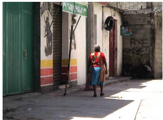
Fig. 3. The picture shows a typical rural woman of low economical level of San Bernardino Tlaxcalancigo, a community surrounding the volcano Popocatepetl.

possible risks. In the first question, they had to answer how worrisome they estimated each risk using a Likert 3-point scale: 1-little worrisome, 2-somewhat worrisome, 3-very worrisome. In the second question, considering that the government had already identified preventive measures for each risk on the list provided, people had to select the five principal risks for which they thought improved preventive measures were needed. The last question was an open question (According to Cozby (2005), it is a question where participants can explain their thinking and their world view in a natural manner) about the risks they perceived as potentially damaging to themselves either in terms of personal safety or property (see Appendix 1).