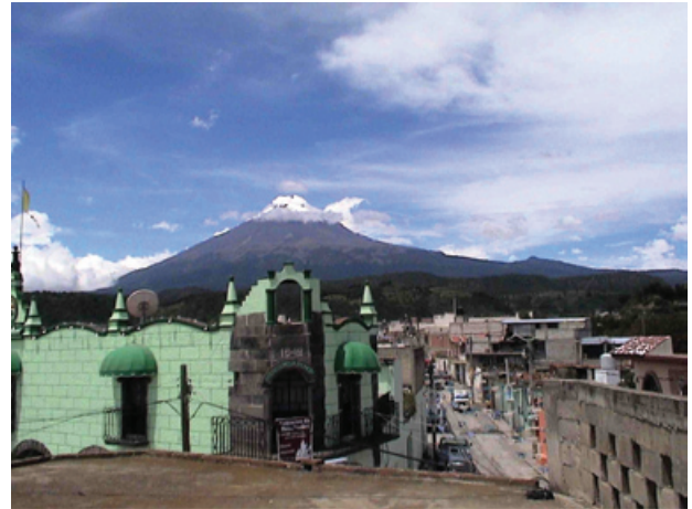
Fig. 7. San Nicolás de Los Ranchos, México, with the Popocatepetl volcano shown along the skyline.

reported feeling significantly more stressed; the same people at the same time, reported using more passive strategies than people exposed to natural hazards (López-Vázquez and Marván, 2003). The results of this study confirm our own, and we can conclude that the industrial hazard is a factor that causes more preoccupation and stress in individuals than do natural hazards.