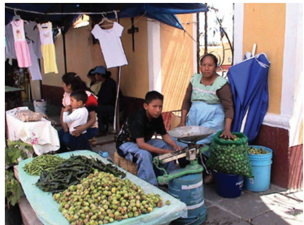
Fig. 4. Woman of San Nicolás de los Ranchos selling vegetables in the street.