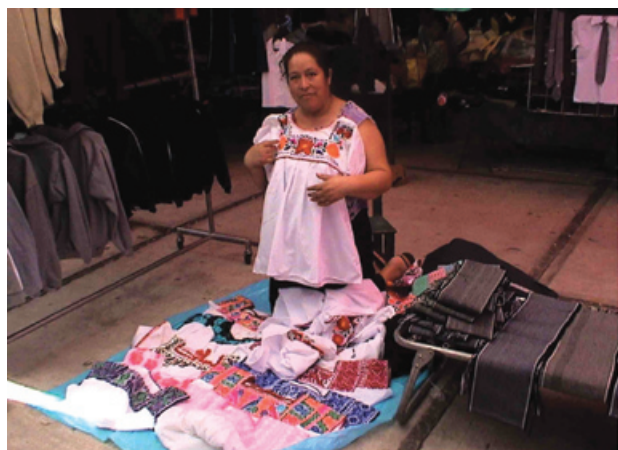
Fig. 5. The Picture shows a women selling typical blouses outside in the street market.

To study coping strategies, participants were asked to answer three open questions. The first question asked respondents about strategies that they had used to cope with perceived risks that could potentially damage their homes. The second question was about the level of preparedness respondents think would be necessary to be resilient in the face of a volcanic eruption. The last question was about the coping strategies that participants think they would use in case of a volcanic eruption (Appendix 2).