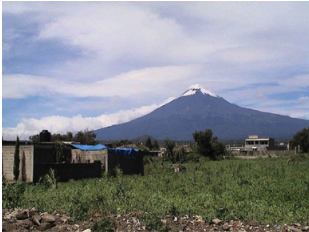
Fig. 6. San Buenaventura Nealtican, Mexico, one of the villages nearest of the Popocatepetl volcano. Behind is the volcano.