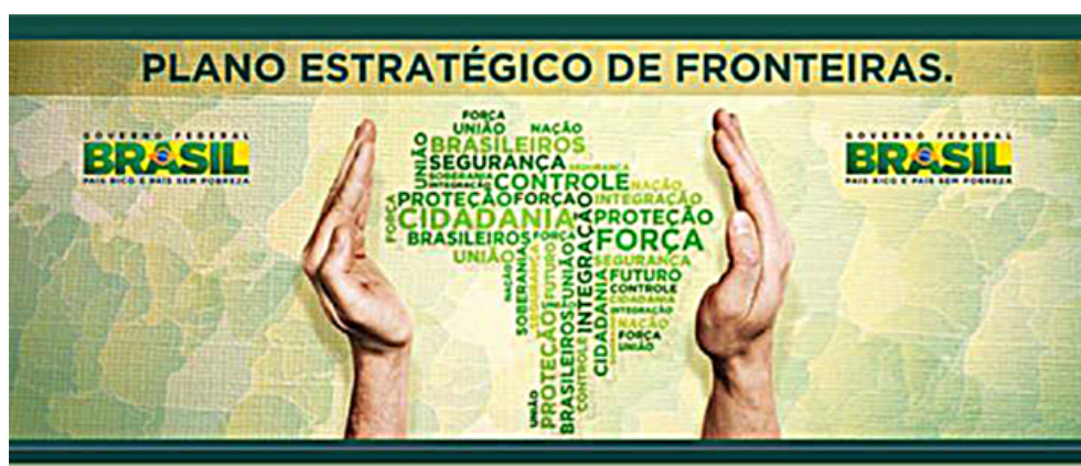
Figure 4. A “Detached” Brazil

Source: Image used in the official launch of “Plano Estratégico de Fronteiras [Strategic Border Plan] (PEF),” June 8, 2011, in the Palacio del Planalto.