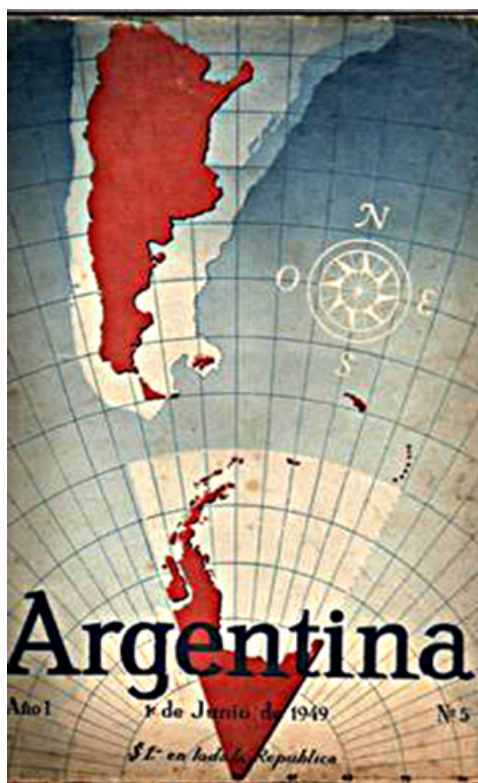
Figure 3. A “detached” Argentina