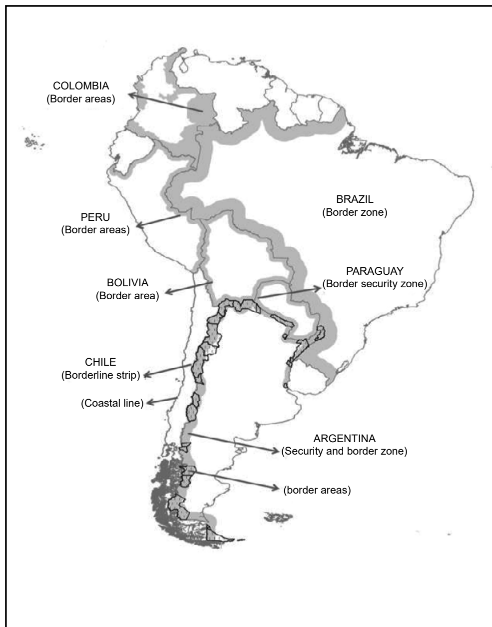
Figure 2. Denomination of the border zones in South America, by country