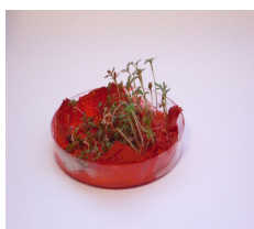
Garden cress exposed to red tattoo ink