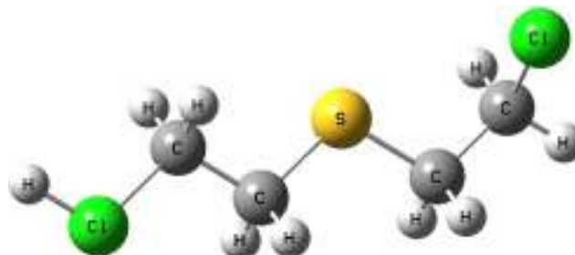
Figure 3 Representation of mustard gas.

where heavy clouds of phosgene clung tenaciously to the bushes”. It is estimated that this gas was responsible for 85% of all deaths caused by chemical weapons during the Great War (Jones, 2014, p. 358; Jünger, 1998, p. 72). In May 1916 the Germans perfected their attacks when they began to use diphosgene (Fig. 2), being in liquid form and at room temperature, favored the load of ammunition. Two months later the French used hydrogen cyanide, and later also used cyanogen chloride, albeit with limited effectiveness, given the low persistence of the compounds (Pita, 2008).