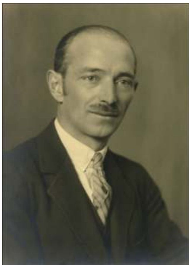
Figure 4 John Arnold Cranston (1891–1972).

It appears to the author that no more promising step in this direction could be taken then by ruthlessly cutting out the historical approach to the subject. The study then becomes a rational one. The physicist's atom is taken as the starting point and a reasonably detailed picture of its structure is drawn. The fundamental laws of chemistry, the concepts of valency, the reactivities of the various elements, and the ionic hypothesis, then tumble out of the picture in a perfectly rational way. Armed with these concepts, plus the purely mechanical one embodied in the law of mass action, the student is then very well equipped to tackle the factual aspect of chemistry. The whole study has become integrated.