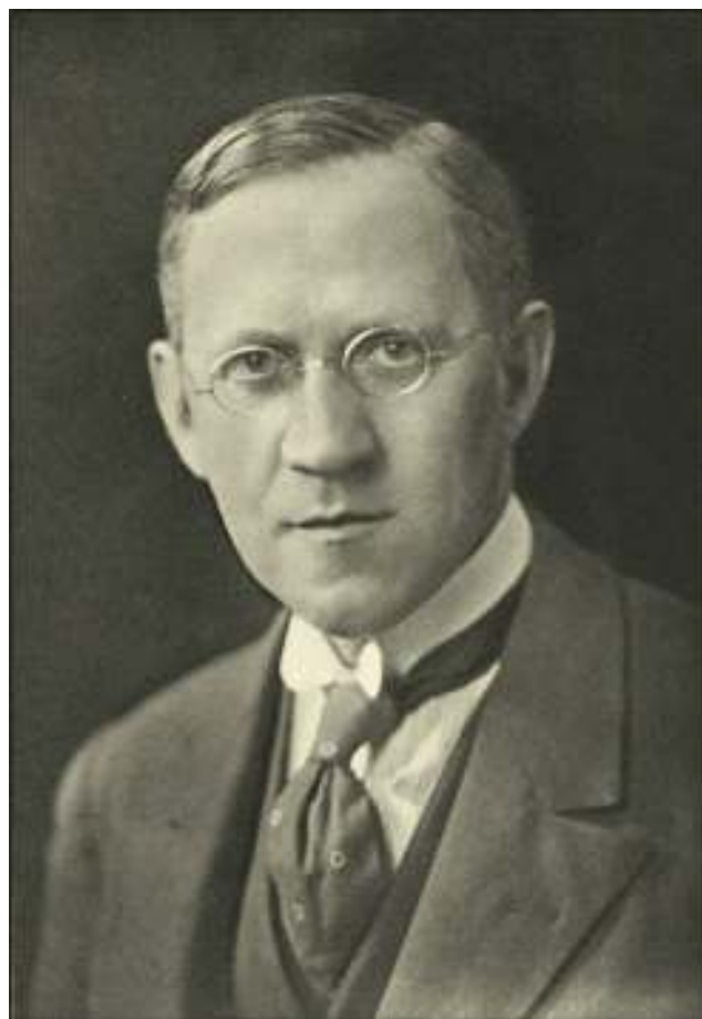
Figure 2 Thomas Martin Lowry (1874–1936).

Lowry's secondary education was obtained at Kingswood School in Bath, a Methodist boarding school founded by John Wesley in 1748. In 1893 he entered the Central Technical College of the City and Guilds Institute in South Kensington and, upon graduation in 1896, became an assistant there to the iconoclastic organic chemist, Henry Armstrong, leading to a D.Sc. degree granted by the University of London in 1899. While working with Armstrong, Lowry simultaneously served, from 1904 on, as a Lecturer in Chemistry at the Westminster Training College, which specialized in the education of teachers for Methodist schools. These associations ended in 1913 when he was appointed head of the chemical department at Guy's Hospital Medical School and as a Professor of Chemistry at the University of London. Finally, in 1920 he was appointed to the newly established chair of Physical Chemistry at Cambridge University, where he remained until his untimely death on 02 November 1936 at age 62.