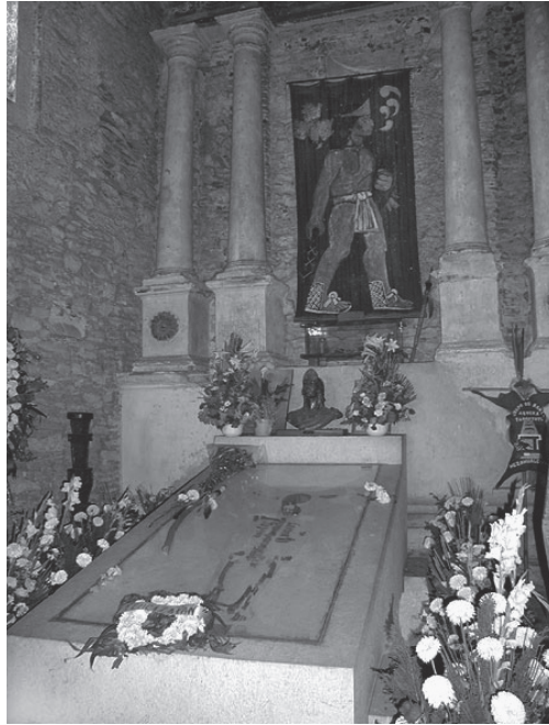
8. The parish church was converted into a memorial