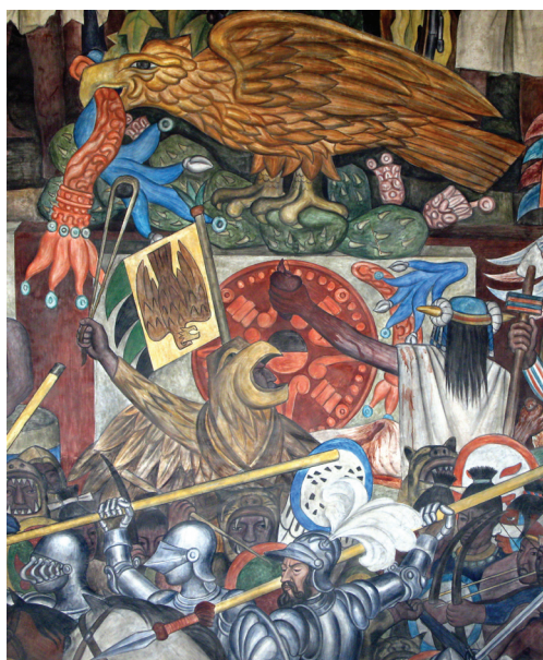
3. Cuauhtémoc dressed in an eagle costume