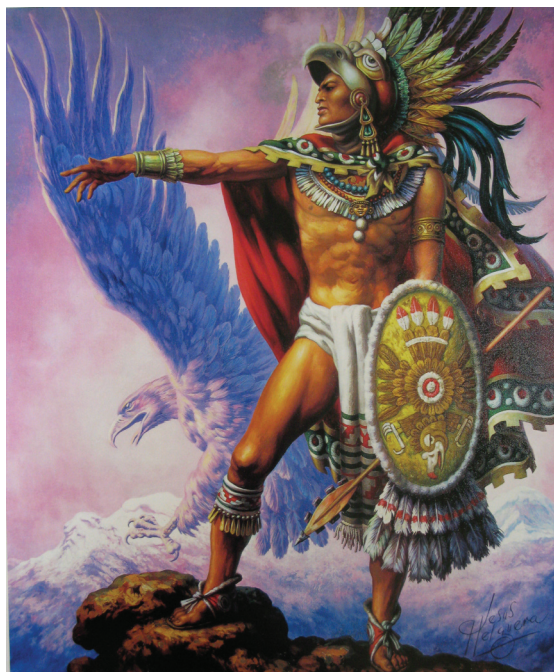
15. Jesús Helguera's Cuauhtémoc (1944)