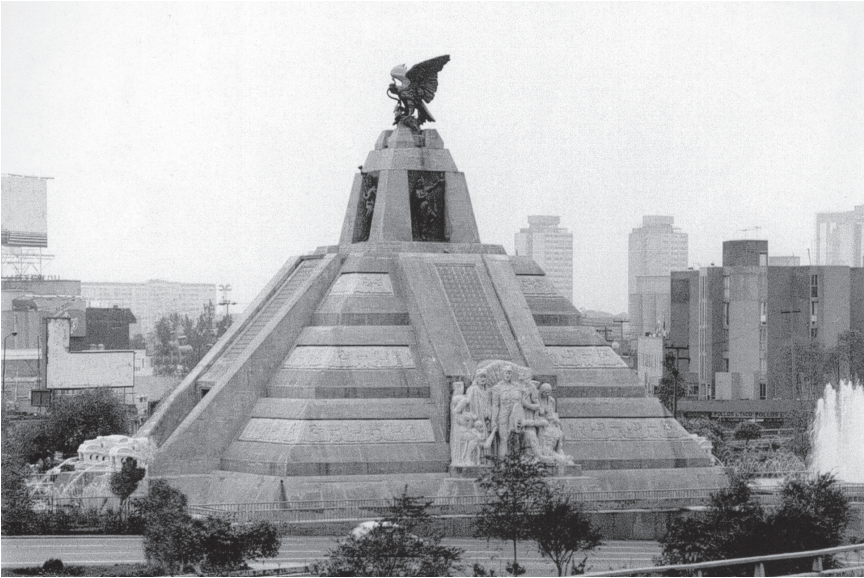
6. Monument of the Race