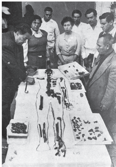
7. A local group of citizens with the archeologist Eulalia Guzmán