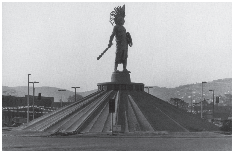
14. Cuauhtémoc Monument in Tijuana