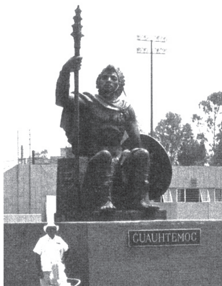
13. Bronze statue, Ciudad Nezahualcóyotl