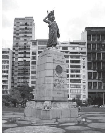
1. Cuauhtémoc monument in Rio de Janeiro

the Díaz regime's use of the image to represent Mexican unity and independence, Pani recalled the symbol in order to project these national values onto a larger continental stage, and in so doing to assert Mexico's leadership in the union of Latin States that was then being formed. 13