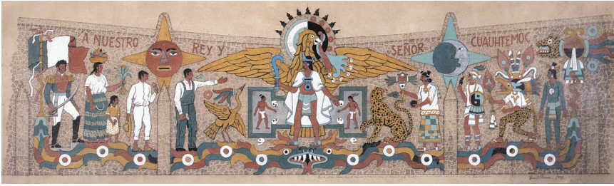
10. Juan O'Gorman's mosaic of Cuauhtémoc, Hotel Posada de la Misión, Taxco, Guerrero

characteristics of the performance among towns within certain areas have had the effect of strengthening regional cultures. 67 The dance fosters solidarity among rural populations and allows indigenous peoples to define their cultural identity through the portrayal of Native American and Western characters.