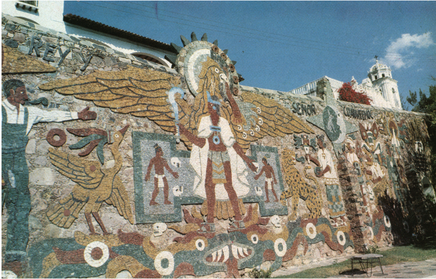
9. Juan O’Gorman’s mosaic of Cuauhtémoc, Hotel Posada de la Misión, Taxco, Guerrero

ancient ballcourt and eagle, which is the chief emblem for both the Aztec empire and Mexican nation as well as his personal hieroglyph. To his right are figures from the modern era —the patriot Vicente Guerrero, a Guerrerense peasant family, and an industrial worker— and to his left figures from the ancient past —a woman, a soldier, a dancer-priest, and a ball player— while sprouting from the serpent’s twin tails are the Mexican flag and an Aztec standard. The inescapable message is that Cuauhtémoc’s authority extends across historical divisions and commands the same respect today as it did in ancient times. This is completely in keeping with literary homages to the Aztec king as well as the views of adherents to the Ixcateopan discovery (O’Gorman himself lent credence to the excavation and sympathized with its defenders).