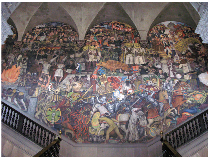
2. From the Conquest to 1830 , Diego Rivera's panoramic mural at the National Palace in Mexico City