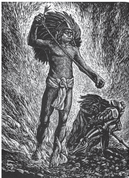
12. Leopoldo Méndez' Cuauhtémoc (1954)