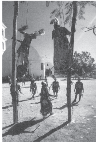
11. Danza de la Conquista

the state of Chiapas, and the Maoist Popular Revolutionary Army (EPR), operating in Guerrero state. 74