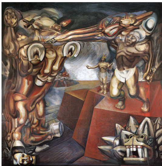
4. Cuauhtémoc against the myth