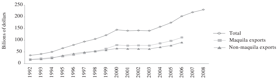
Figure 1 Manufacturing and maquila exports (billions of dollars)