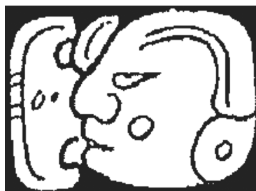
FIGURE 2. Glyph for Naj (Nah) . Adapted from Stuart, 1998: 377.

The final term joolnaj 'door' is an effective conclusion to the couplets of this section in that although it clearly refers to door of a house, it also appears to be symbolically related to the notion of head. It is interesting to note that in ancient Mayan pictorial writing the notion of 'house' was depicted as a human head (see figure 2) and its 'door' was expressed as its mouth (Martel & López, 2006). This section of the poem corresponds with the general conceptualization of the house as a head by creating a concept within a concept effect in which the protagonist is returning home to her own head or house of thought.