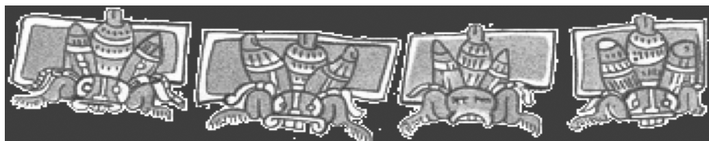
FIGURE 3. Ko'olel Kaab 'Lady Bee.' Images adapted from the Madrid Codex p. 105. Retrieved from < http://diccionariodesimbolos.com/abejasyhormigas.htm >, July 19, 2014. Reprinted with permission.