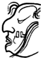
FIGURE 5. Glyph for Na , 'Mother'. The graphic in her cheek is the ik sign for 'wind/breath/life/spirit'. Adapted from Montgomery, 2002: 178.