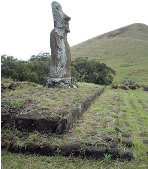
FIGURE 2. Moai on Plattform, Easter Island (Chile)

stones used in the construction symbolized particular ancestors and when a new marea had to be built one of these stones was moved there, to transfer some of its power to the new place (Wallin, 1993). This example of the Polynesian mana might serve us as a useful intercultural comparison with the stela-cult of the Maya. As the example illustrates we should take caution not to be misled by the physical size or the visual attraction of an object when we speculate about its religious importance. In other words, the artistically most impressive image of a ruler on a stela was not necessarily more important in terms of ancestor worship than for example a much smaller and uncarved stone erected for the same purpose. The concept of the mana also illustrates that the spiritual essence supposed to be resting in the stela was not necessarily permanently and entirely bound to one place but could rather be removed or circulated between different places. In fact, such an idea of a person's life force being transferred or connected to different stone objects is documented in both colonial documents and ethnographic descriptions discussed below.