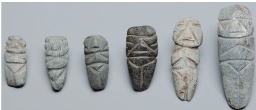
FIGURE 6. Collection of camahuiles

The first example are small anthropomorphic stone images of pre-Hispanic origin, which are frequently found in possession of shamans, who either keep them on their domestic altars or in sacred bundles. In fact only few of these figurines were actually uncovered in archaeological excavations, although a large number of them can be found in museums and private collections all over the world (figure 6). This apparent contradiction is easily explained by the fact that the Maya themselves have collected them for a long time. Consequently the majority of these objects did not remain in the ground but circulated in the communities and were inherited from one generation to the next.