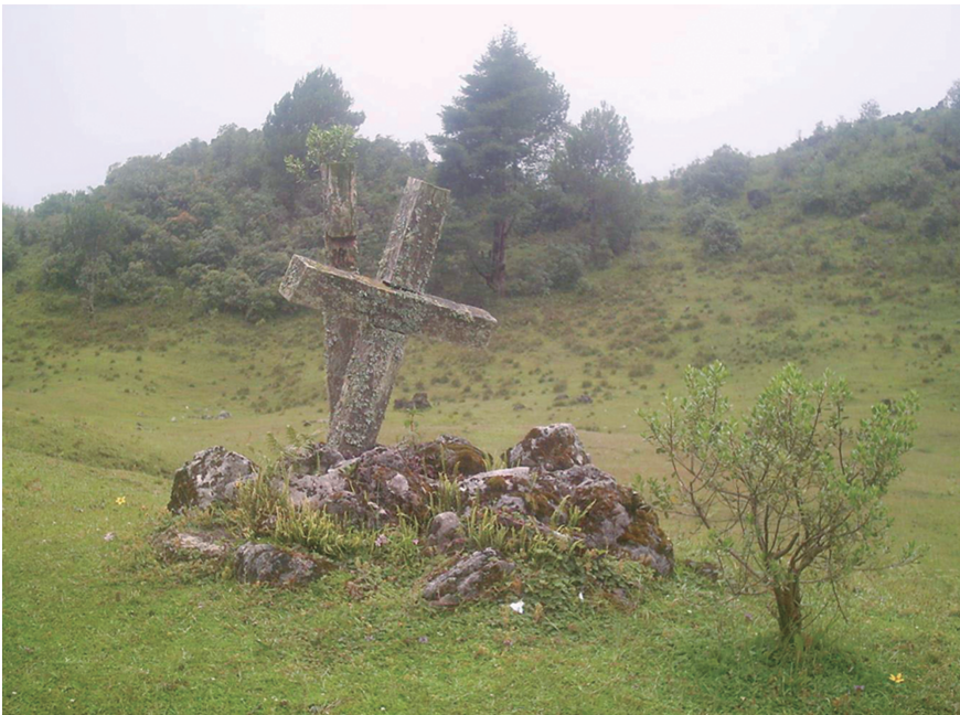
FIGURE 5. Altar in the mountains south of San Mateo Ixtatán

Another parallel between the modern altar and the ancient stela is their relationship to the concepts of time and the calendar. In fact the 260-day calendar survived in different communities in Guatemala into the present and the cycles defined by the numbers 1-13 combined with the 20 Day Lords continue to shape ritual life. For example some altars are dedicated to individual Day Lord and others are just visited on specific dates (Tedlock, 1992; Deuss, 2006). In any event, from the point of view of a modern Maya shaman the sacred landscape of the communities is not only defined in a spacial sense but also in a temporal one with specific dates being linked to specific places. In this context the altars —just like the stelae— can be considered not only as representations but even as embodiments of time itself (figure 5).