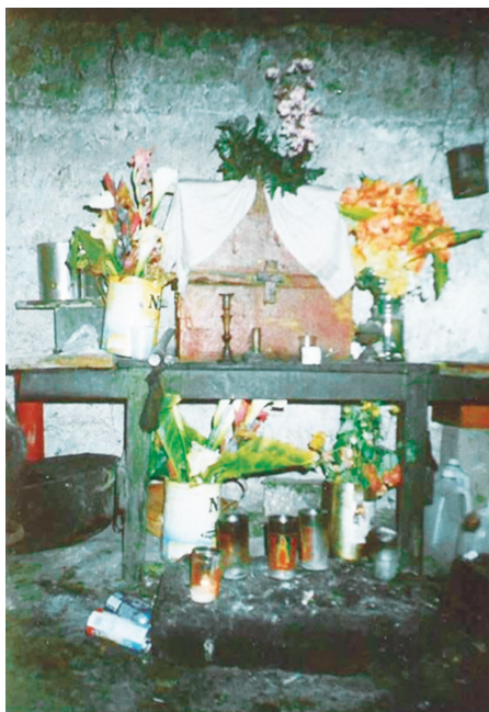
FIGURE 3. Caja real in Todos Santos Cuchumatán (Guatemala)

area. So the entire community started to pray in front of the sacred chest and finally it demonstrated its power: The Guerrilleros in the mountains got scared and paralyzed in terror so that they could easily be killed by the people of San Mateo.