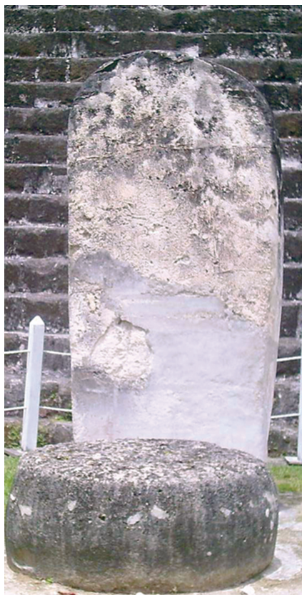
FIGURE 1. Stela with Altar, Tikal (Guatemala)

Especially the carved stelae with the images of rulers and the inscriptions commemorating their deeds must have served as sites of memory which helped to keep royal history alive in the minds of the people. Due to the dynastic nature of ancient Maya rulership, the stelae must have served both as symbols and sources of political power, which confirmed the legitimacy of the ruling lineage. In this context it is noteworthy that in instances of dynastic changes stelae of former rulers were sometimes relocated, damaged, or even used as filling material in the construction of new buildings (Martin and Grube, 2008: 29, 196).