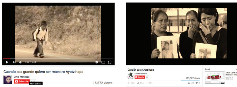
FIGURE 3 STORY-TELLING IMAGES IN PRESENT TENSE