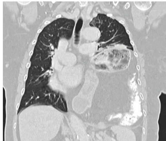
Figure 1. Thoracoabdominal computed tomography image. This pulmonary image reveals the type IV paraesophageal hernia.

At first, the usual laparoscopic approach hernial defect correction was successfully performed, reducing the transverse colon and the greater omentum in the abdominal cavity. However, reduction of the proximal stomach was not possible due to chronic strangulation and a shortened esophagus. The esophagus was poorly visualized forcing a medial supraumbilical