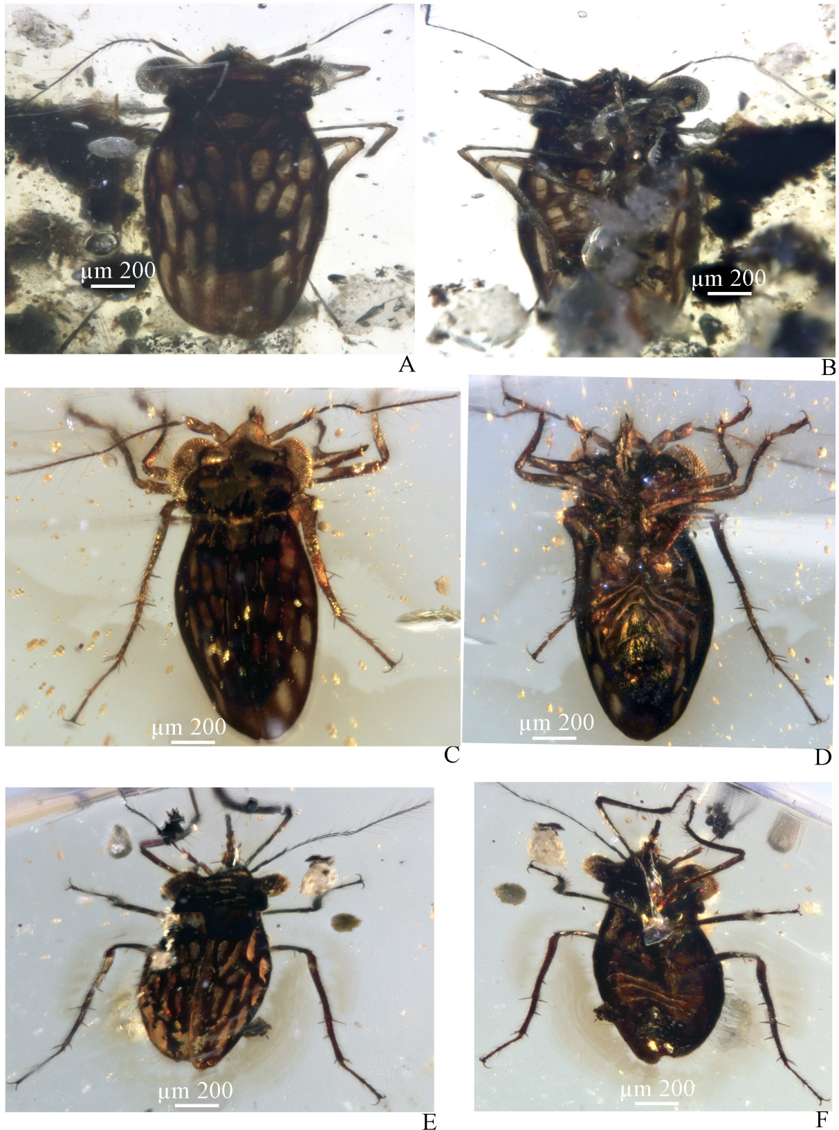
Figure 1 Dorsal and ventral view of three specimens of Hypsotsijilia bretoni Cifuentes-Ruiz and Brailovsky gen. et sp. nov. Important taxonomic characters are visible, such as eyes, mouthparts, antennae, pronotum, legs and the elytriform forewing pattern.