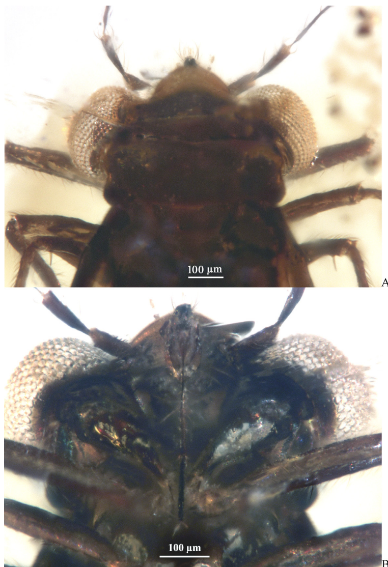
Figure 2 Dorsal (A) and ventral (B) view of the head and pronotum. Prominent eyes, a rectangular pronotum and the pronotal collar are visible (A). Head and mouthparts such as clypeus, labrum and labium with several setae are visible from the ventral view, fore coxae can be appreciated too (B).