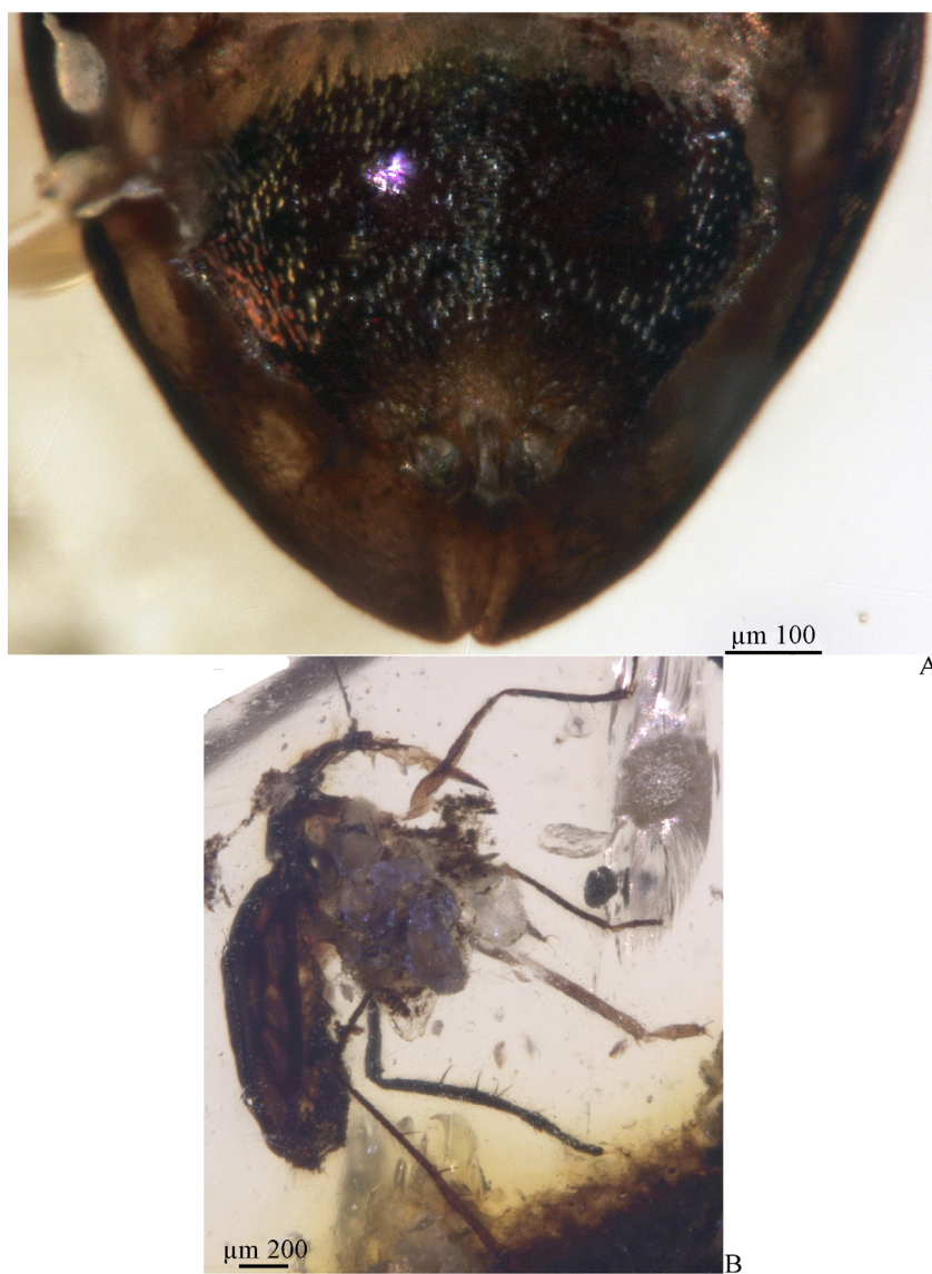
Figure 5 Ventral view of the abdominal apex, the tips of the gonapophysis are visible (A). Lateral habitus of the specimen, setae on the mouthparts and legs are visible, as well as tarsi (B).