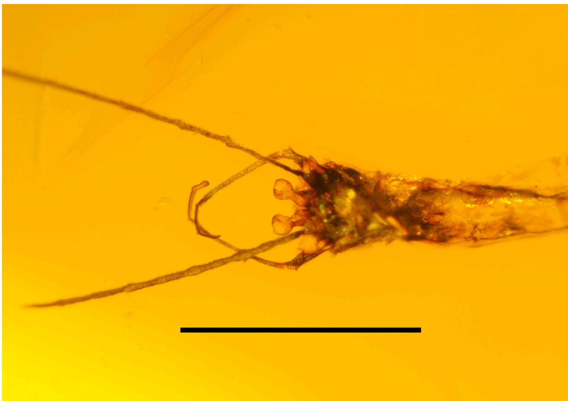
Figure 3. Dorsal view of genitalia of male imago holotype of Maccaffertium annae sp. nov.