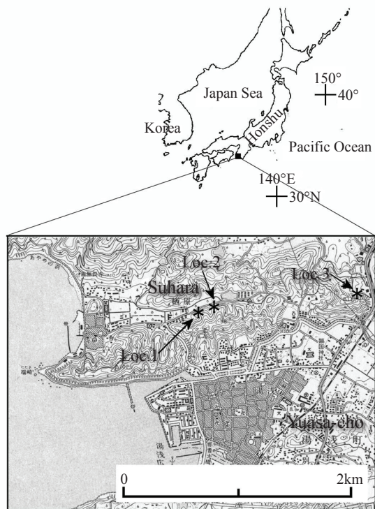
Figure 1. Map showing fossil-bearing localities (topographical map of “Yuasa”, scale 1:25,000, published by Geographical Survey Institute of Japan).

Loc. 03. Cliff (present lost), east of loc. 2, Suhara, Yuasa-cho, Wakayama Prefecture (34°2'38.2" N; 135°11'20.8" E);