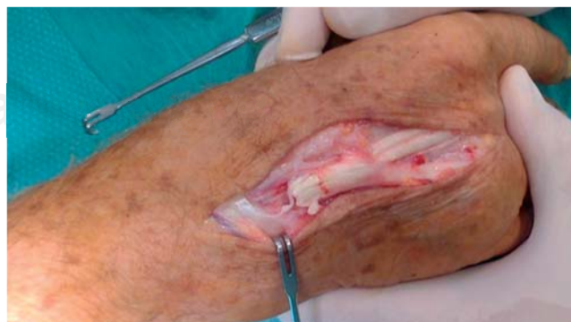
Figure 1. Intraoperative findings of tendon injury. The tendon is devoid of inflammatory signs, but there is a pronounced lesion and degeneration.

For the first four weeks after surgery, a dynamic wrist brace was modeled. We used a dynamic splinting program opposite to the one that is used for flexor tendon repair, with an outrigger splint holding the fingers in extension and allowing full active flexion. The wrist is maintained in 30 to 40 degrees of extension. Dynamic extension is applied to maintain the MP's and IP's in full extension allowing for flexion. There can be a flexion stop at MP 60 degrees. The patient has been followed by a physiotherapist who applies passive mobilization for the first 20 days and then switch to active mobilization assisted in the following 10 days. At