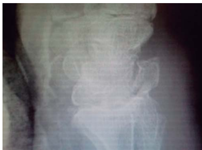
Figure 2. The lateral view of the wrist X-ray shows an alteration of the cortical bone lunate with suspected fracture.

In the days following the surgery, radiographic examinations were performed aimed to observe the carpal