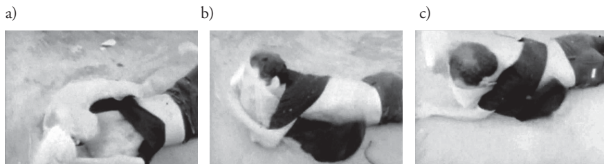
2a-2c). Hélio Oiticica, Parangolé Pt17 Cape 13 "I am Possessed" , 1967. Filmstills taken from Cardoso, Heliorama (vid supra n. 6).

banda religion. 16 The dances during the rites of the Orixá cult resemble the Samba; it is all about trance, in so far as the “possession trance” plays an important role. Then, the persons in trance receive a white bandeau, called oja , wound around the upper part of their bodies and they wear oxu , a conical pack of ingredients that protect the sacred cuts received during the initiation rite. The priest or priestess is considered to function in a creative capacity causing the novices’ birth. In this sense, art historian Mikelle Smith Omari describes the procedure as follows: