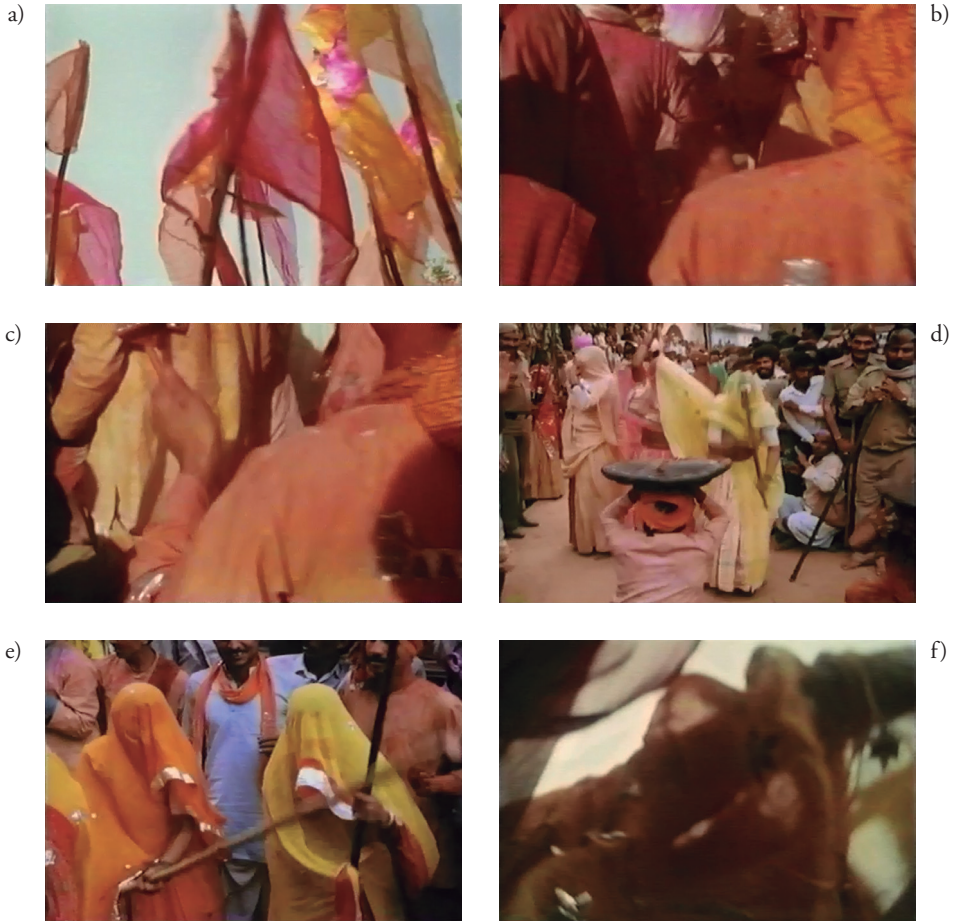
6a). Colored banners in the Holi Festival in India; b, c) camera shows closeups of pilgrims wearing colored clothes during their ascent to the temple of the village of Nandgaon; d-f) veiled women of the village of Barsana (actually but symbolically) beating men with long bamboo sticks. Filmstills taken from Beeche, Holi: A Festival of Color. A Hindu Celebration (vid supra n. 67).