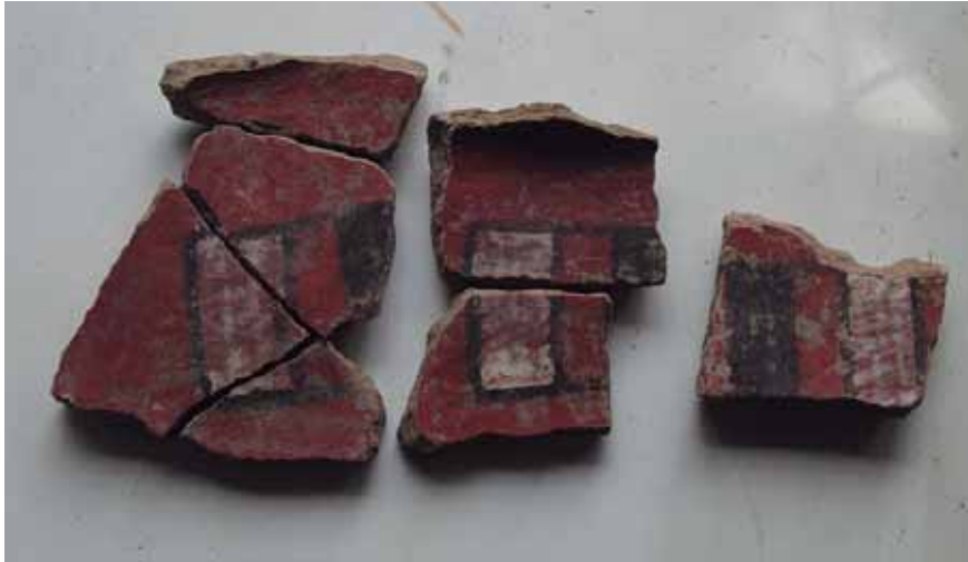
3. Fragments of a large serving bowl of the Banderas Sencillo substyle excavated in the palace of the Acropolis (CHO5-56, units 4 and 8, level 1).