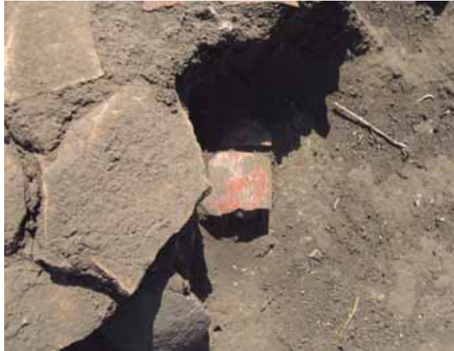
5. Banderas sherds in situ in the Acropolis palace, unit 3, level 2.

Although from looted examples we can delineate several subvarieties of Banderas Polychrome, the Banderas Polychrome vessels from Cihuatán are almost entirely of a single type which we call Banderas Codex. 10 These vessels have a highly polished red background with motifs clearly related to, derived from, or ancestral to, those of southern Mexico. Unfortunately, we have only a very small comparative sample of excavated and published Early Postclassic Mixteca-Puebla Polychrome from southern Mexico and it is not very similar. Banderas ceramics, for example, lack the elaborate step fret designs characteristic of the Mexican ware. In fact, Banderas iconography is quite limited and ignores many of the common themes of Cholula, being, in some ways, more central Mexican in content. This immediately raises questions as to how such a developed iconography was introduced, especially since no genuine pieces