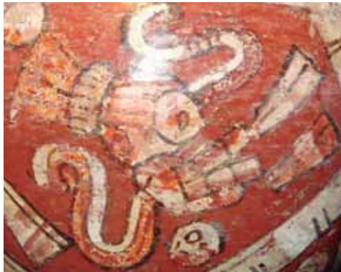
6. Banderas chalice with depictions of (a) crossed bloody bones and crossed space dividers (b) a bloody rib cage, and (c) detail of a skull with the temilloti hairdo and blood flowing from the neck region. All designs also include eagle-down balls, and maguey spines. Height 15.7 cm. Provenience unknown. Private collection, San Salvador, El Salvador.