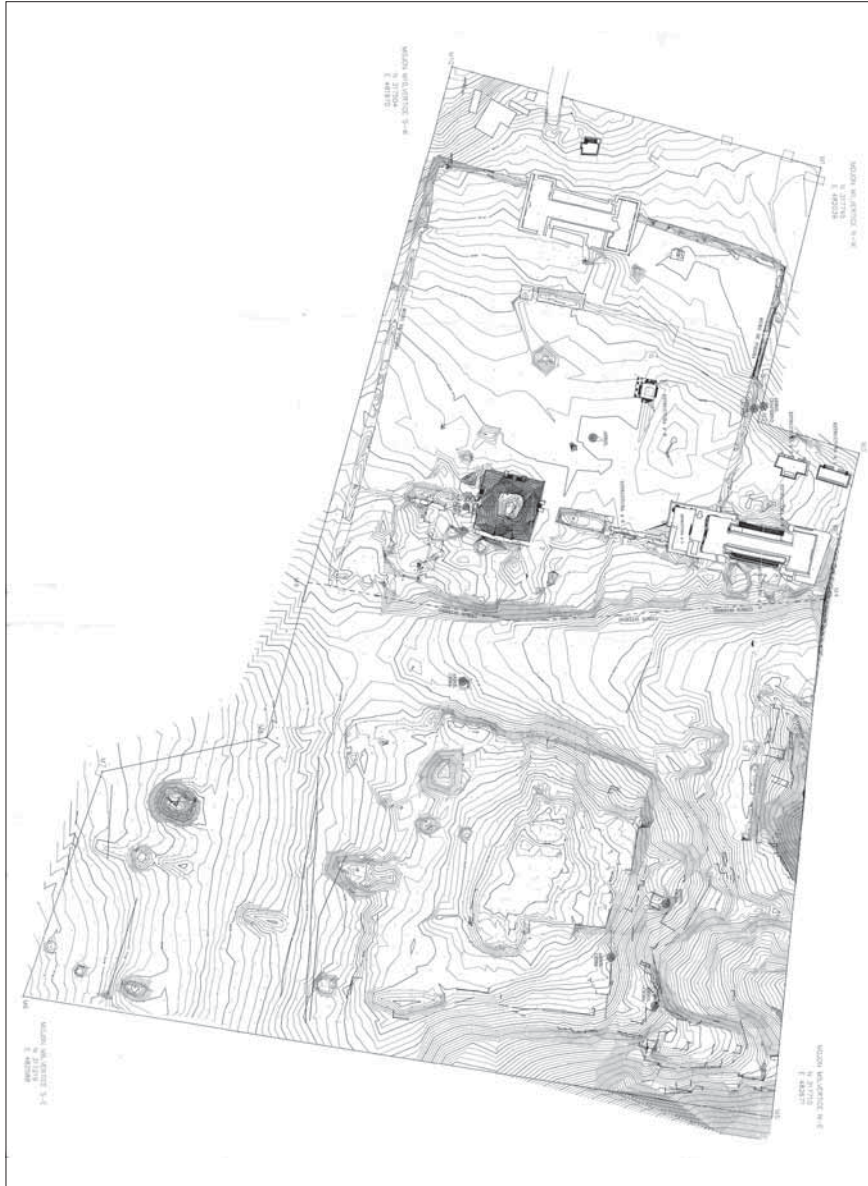
2. Plan of Cihuatán showing major structures and their relationships. The Ceremonial Center, the Acropolis, and environs. Drawing: APSIS.