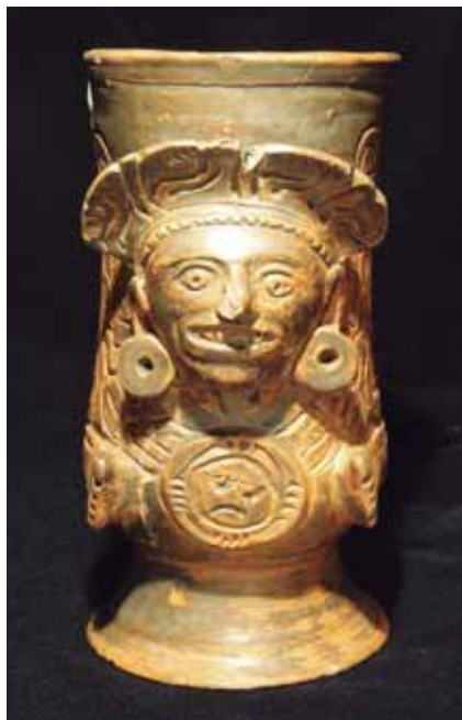
11. Tohil Plumbate vase with a figure wearing a pendant. Provenience unknown. Private collection, San Salvador, El Salvador.

Another motif, and one which places Banderas Polychrome firmly in the Early Postclassic Period is a pendant or necklace identical to those represented on Tohil Plumbate ceramics (fig. 11). Tohil Plumbate is, of course, the hallmark of the Early Postclassic, appearing at the beginning of that epoch and disappearing sometime shortly before AD 1200. Tohil Plumbate is common in all contexts at Cihuatán, and Banderas Polychrome has been found in situ with Tohil Plumbate at that site.