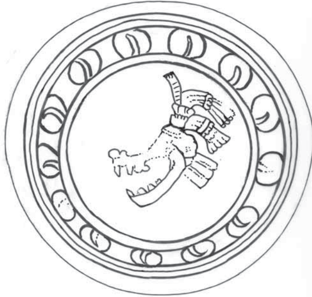
14. A small rounded bowl or plate with the head of a long-jawed skeletal supernatural creature. Currently in the collection of the Museo Universitario de Antropología, Universidad Tecnológica de El Salvador, San Salvador.

same contexts as a plethora of other decorated wares including a series of local polychromes, Nicoya Polychrome, a local version of Fondo Sellado , and the plumbates.