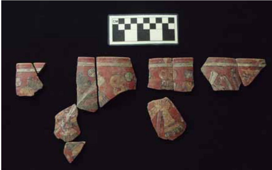
10. "Eagle vase" from the Acropolis Palace. Provenience: CHO-64 and allied contexts.

Blood spotted crossed bones and flying rib cages are likewise common motifs that suggest warfare and sacrifice (figs. 6b and c). Dismembered body parts also refer to customs of dismemberment of sacrificial victims better known from Late Postclassic Central Mexico (fig. 9).