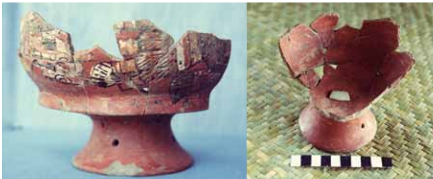
4. A small Banderas cup with a chimalli design found as a dedicatory offering buried in the center of the floor of Structure ss-50 in 1977.