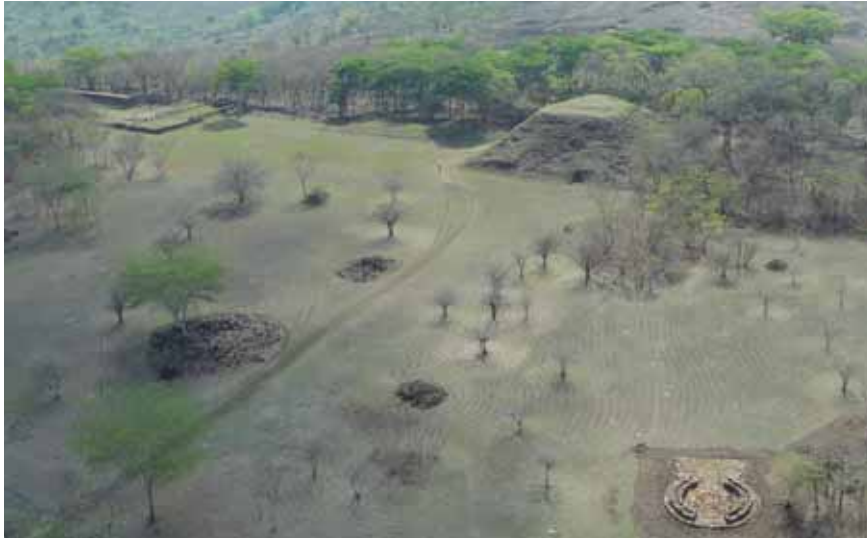
1. A helicopter view of the Ceremonial Center of Cihuatán with the Acropolis excavations visible at the top of the photograph.

East, although on higher ground than the Ceremonial Center, is the Acropolis (fig. 2). Ongoing investigations here have uncovered a series of residential and ritual structures, including a central Mexican tecpan style palace, presumably the living quarters of the rulers of Cihuatán. We do not know who the rulers of Cihuatán were, their origin, or their ethnicity. A possibility is that they were highland Guatemalan or Salvadoran Maya who had absorbed the new elite culture which arose after the Late Postclassic political collapse and were using it to set themselves off from the Classic period rulers. Another possibility is that they were Mexicans who originated in one of the regions strongly affiliated with the new traditions of the Postclassic, as were Puebla and Veracruz. Whoever they may have been it seems very unlikely that they were the ancestors of the historic Pipil, even if the latter were, ultimately, of Mexican origin. 5 This new ruling elite seems to have been either very power-