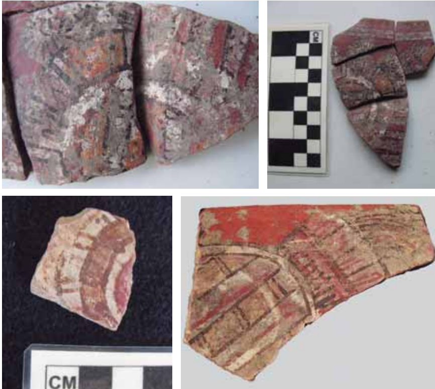
13. Sherds of several vessels from the Acropolis of Cihuatán showing variants of the chimalli design. (a) This piece seems to be an intermediate style between Copador and Salua and Banderas Polychrome. Provenience unknown. Private collection; whereas (b) and (c) are sherds of Banderas chalices excavated in the Acropolis Palace.

Excavations both in the monumental center and in the surrounding residential neighborhoods have revealed that people simply fled, or perished, leaving their belongings where they were using them to be crushed on the floors by the falling walls and roofs of the buildings. Spear points are commonly found in the burned layers and the only human remains we have encountered in the Acropolis excavations were male crania (and a humerus), caught in drains and obviously pertaining to the violent end of the city.