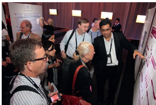
Figure 1 Discussions around a poster at ESC Congress.

There is huge and international enthusiasm for participation in the congress with a record number of submissions for scientific planned sessions (more than 400 were selected) and the second highest ever number of abstracts were submitted (10,490). To make the congress more manageable we have again arranged the congress into “villages” of