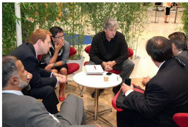
Figure 2 Round table discussions at ESC.

related topics. Thus, a village may include presentations in one room on heart failure and in an adjacent room on heart rhythm disturbances. Through the village concept the congress becomes more manageable and interactive. Important new guidelines will be presented at the ESC Congress 2013 on arterial hypertension, cardiac pacing, diabetes, and stable coronary artery disease. Linked to these will be dedicated scientific sessions, case based Focus Sessions.