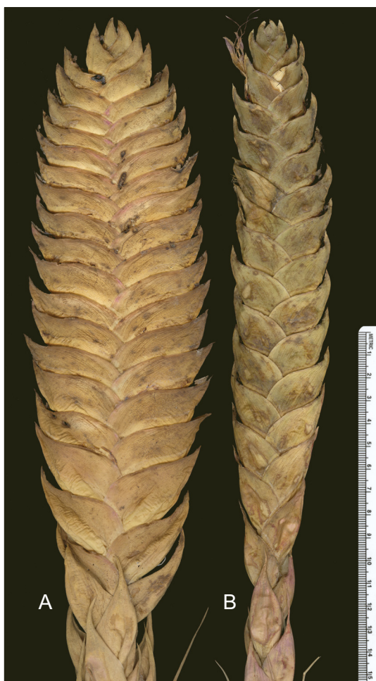
Fig. 3. Dried spikes. A. Tillandsia jalisco monticola Matuda ( J. Ceja et al. 1473 (UAMIZ)); B. Tillandsia magnispica Espejo & López-Ferrari ( A. Espejo et al. 6312 (UAMIZ)).

Paratypes: Mexico, Oaxaca, distrito de Pochutla, municipio de San Pedro Pochutla, N of Pochutla, 1981, C. S. Gardner 1445 (SEL, US, line drawing by Gardner, 1982); distrito de Pochutla, municipio de San Pedro el Alto, 18 km al S de San Miguel Suchistepec, sobre la carretera a Pochutla, 1700 m s.n.m. Bosque de Pinus