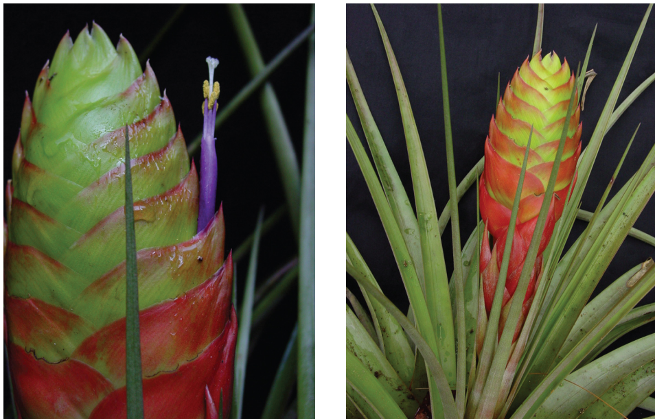
Fig. 2. Tillandsia jaliscomonticola Matuda ( J. Ceja et al. 1473).