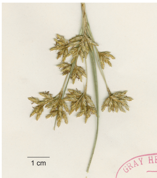
Fig. 1. Inflorescence of Cypringlea analecta (Beetle) M. T. Strong [ Purpus 5454 (GH, isotype)].

Cypringlea analecta (Beetle) M. T. Strong, Novon 13: 125. 2003. Scirpus analecta Beetle, Brittonia 5: 148. 1944 (as Scirpus analecti ). Type: Mexico. San Luis Potosi, Minas de San Rafael, May 1911, C. A. Purpus 5454 (holotype, NY; isotypes, F, GH, MO, UC (has date of July 1911 according to Strong, 2003), US).