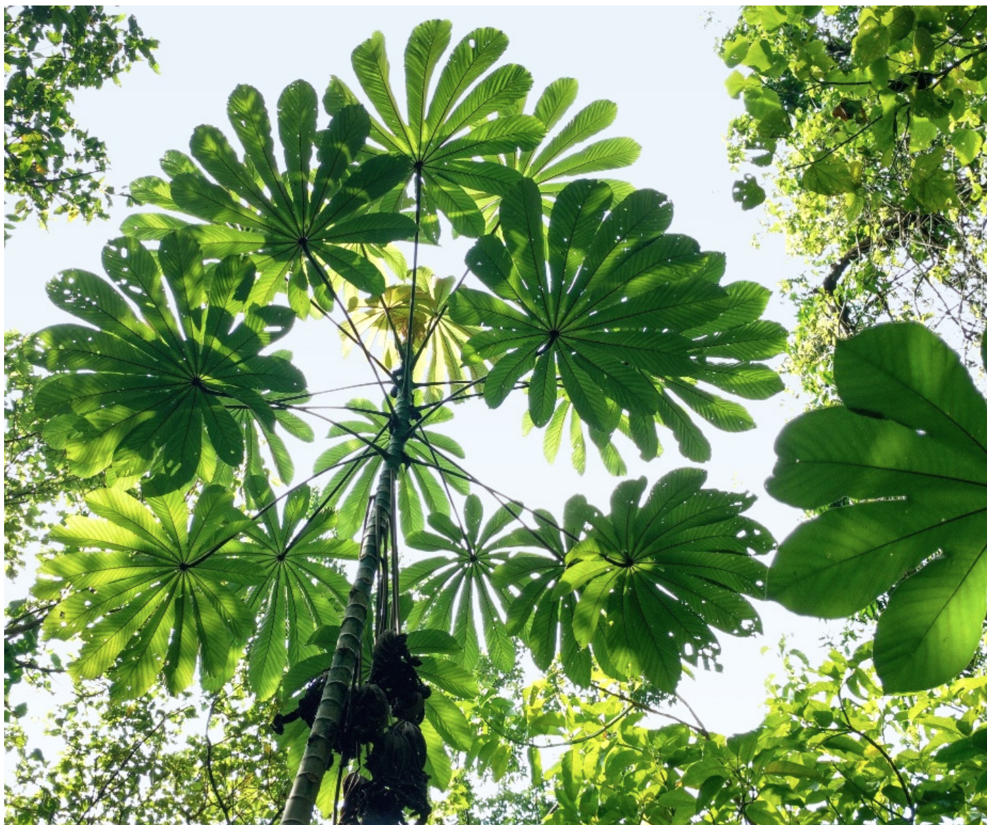
Figure 2: Guarumbo ( Cecropia obtusifolia Bertol). from a plant growing in the “Los Tuxtlas” Tropical Biology Station-UNAM, San Andrés Tuxtla, Veracruz, Mexico.