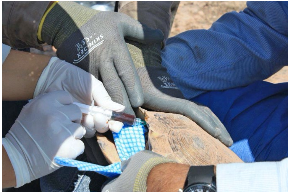
Figure 1. Blood collection from the subcarapacial vein in a Gopherus flavomarginatus tortoise.

Tortoise samples were collected under the DGVS 07249/15-16-17 permit granted by SEMARNAT, Mexico.