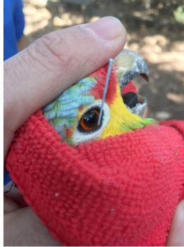
Figure 2. Measurement of tear flow in red-lore parrots using ABC Dental ® color paper tips # 30.