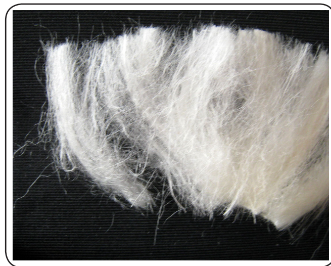
Figure 3. Fibers of alginate stabilized with calcium (personal document).

New generation of medical textiles are an important growing field, showing great expansion, in wound management products 30 . The main qualities of fibers and dressings as wound care products include that they are bacteriostatic, anti-viral, fungistatic, non-toxic, high absorbent, non-allergic, breathable, haemostatic, biocompatible, and manipulatable to incorporate medications, with good mechanical properties. Textile structures used for modern wound dressings are of large variety: sliver, yarn, woven, non-woven, knitted, crochet, braided, composite materials. Specialized additives with special functions can be introduced in advanced wound dressings with the aim to absorb odors, provide strong antibacterial properties, smooth pain and relieve irritation. Because of unique properties as high surface area to volume ratio, nanoscale fiber diameter, porosity, light weight, nanofibers are used in wound care. Nanofibers of alginates were produced by electrospinning technique in presence of various synthetic polymers and/or surfactants to improve processability 31 . Calcium alginate fibers have a novel gel-forming capability in that, upon the ion exchange between sodium ions in the contact solution and calcium ions in the fiber, the fiber slowly transforms into a fibrous gel. The gel-forming process for alginate fibers and the gelling behavior of various types of alginate fibers were described.