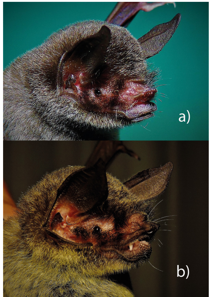
Figure 1. Photographs of two species of Mustached bats, a) Pteronotus personatus and b) Pteronotus parnellii , currently considered two different species distributed in Mexico, Pteronotus mexicanus and Pteronotus mesoamericanus .

based study conducted in México described the diet and trophic overlap of three species of Mormoopidos ( P. davyi , P. personatus , and P. parnellii ) in Chamela, Jalisco (Salinas-Ramos et al. 2015; Figure 1).