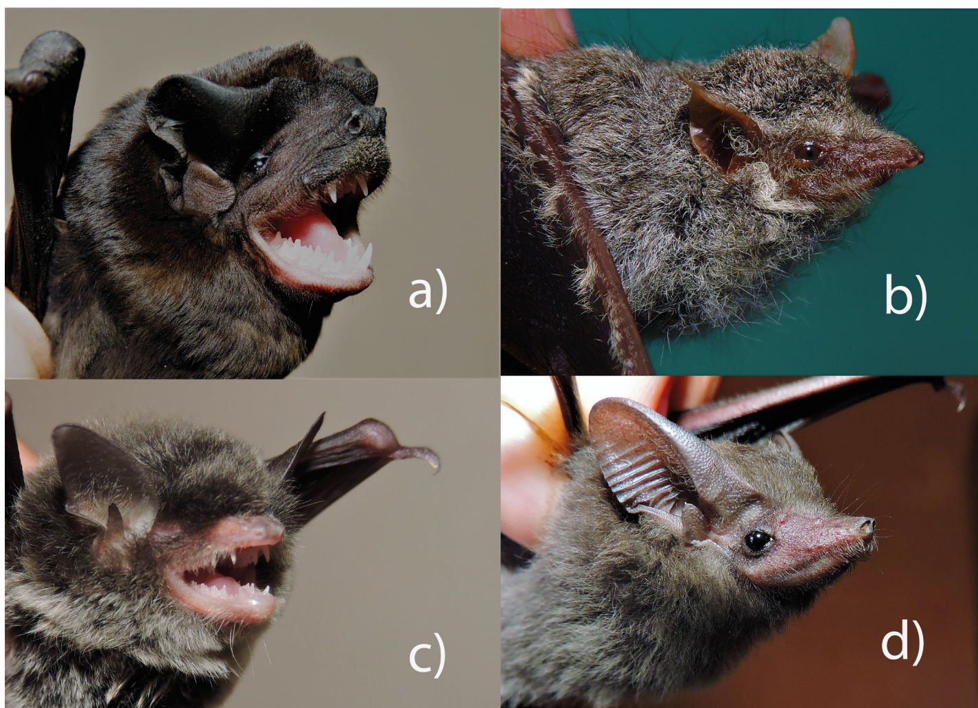
Figure 2. Some species' diets have been described through molecular studies in México. a) Black mastiff bat Molossus rufus , b) Proboscis bat Rhynchonycteris naso , c) Hairy-legged myotis Myotis pilosatibialis , and d) Lesser dog-like bat Peropteryx macrotis (Photographs by Cintya A. Segura-Trujillo).

However, taxonomic identification is only the basis, as it is essential to classify prey based on their functional traits. These traits are helpful for defining interactions with bats or identifying whether bats are preying on species relevant to agriculture or human health. One example, in the case of moths, which are the preferred food of bats, it is difficult to detect them visually in bat droppings due to the low keratin content of their bodies. As a result, their remains are largely broken-down during digestion, making their identification at suborder levels difficult. In research using high-throughput sequencing, most moths can be identified at the family level. However, it is difficult to identify them at the genus or species level because there are not enough sequences of moths from México in GenBank to accurately identify their exact species. In some cases, moths can be identified at the species level when they are of agricultural interest. For example, moths such as Helicoverpa sp., Spodoptera sp., and Plutella xylostella , whose larvae are significant pests in agriculture, have been found in the diet of bats. This is possible because reference sequences for comparison and identification are available, thanks to their importance in the agricultural economy.