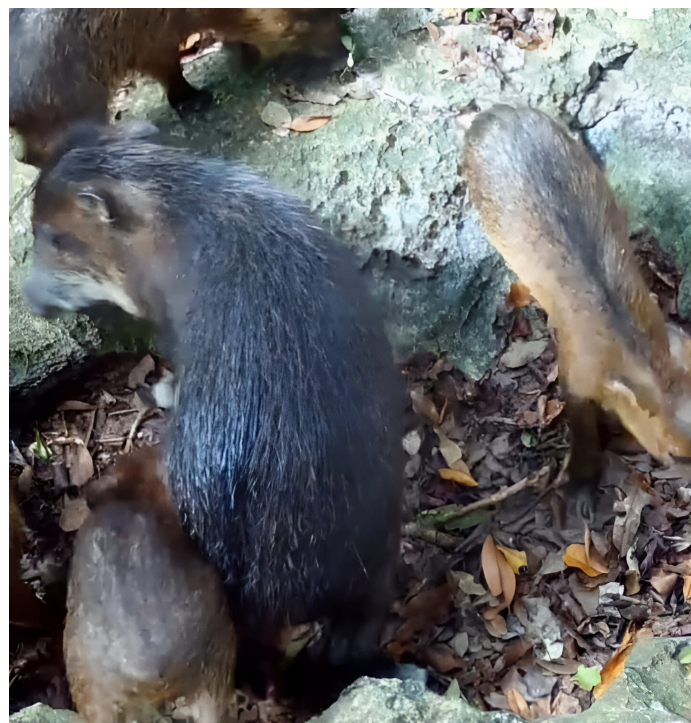
Figure 2. Female Jagüilla with her three offsprings in the mountains of PN Sierra de Agalta, it is assumed that there is a small population moving in the highlands, between 1,200 and 2,000 masl, in the tropical montane, submontane, and lower montane forest.

One of the important aspects of this work is to highlight the importance of Sierra de Agalta NP as a potential site for future research efforts, biological monitoring, patrols and operations for the development of conservation processes for the jagüilla as a conservation target of the park (Figure 2), since the last records of this species were recorded