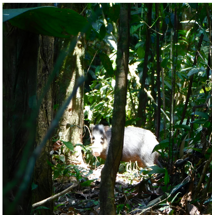
Figure 3. An adult jagüillas recorded in the Warunta Mountains, in the tropical evergreen lowland broadleaf evergreen forest, in the FINZMOS territorial council.

at the Quebrada del Sol site in Sierra de Agalta NP in 1994 (Marineros and Martínez 1998). Based on the above information, it could be assumed that a population was disaggregated in Sierra de Agalta NP, moving along an altitudinal gradient from 1,200 masl to 2,000 masl, moving between submontane evergreen tropical forest, montane and lower montane ecosystems. There may also be small groups of jagüilla within the declared protected area "Pech" Montaña El Carbón Anthropological and Forest Reserve and the proposed protected area Sierra del Río Tinto National Park, because the distances between the core zone of the RHBRP and Sierra del Río Tinto National Park is between 15 to 20 linear km, and the Anthropological and Forestry Reserve 'Pech Montaña El Carbon' and the proposed protected area Sierra del Río Tinto National Park are part of the same mountainous continuum, but these protected areas do not appear in the modeling of the potential distribution of Tayassu pecari (Portillo and Elvir 2016).