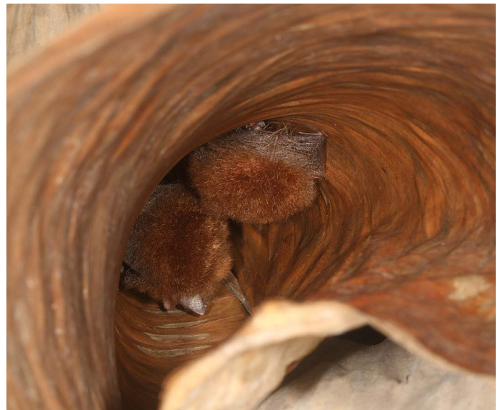
Figure 3. Two Thyroptera discifera roosting in a portion of a dead banana leaf. There had been additional bats in that cone earlier in the evening, but they had already exited. Photograph taken near La Paloma Lodge Drake Bay, Costa Rica on 20 February 2021.

It stayed there for one day. The main conical roost was lopsided with length 50 cm on one side and 40 cm on the other (Figure 3). Height from ground to entrance was 169 cm with roost opening 20 cm wide. The cone that was occupied for one day by a single bat and that was beneath the other cone was of about the same dimensions. Although the bats were not handled, the number occupying the roost varied from only 2 to 5 some days to perhaps 10 or more on others.