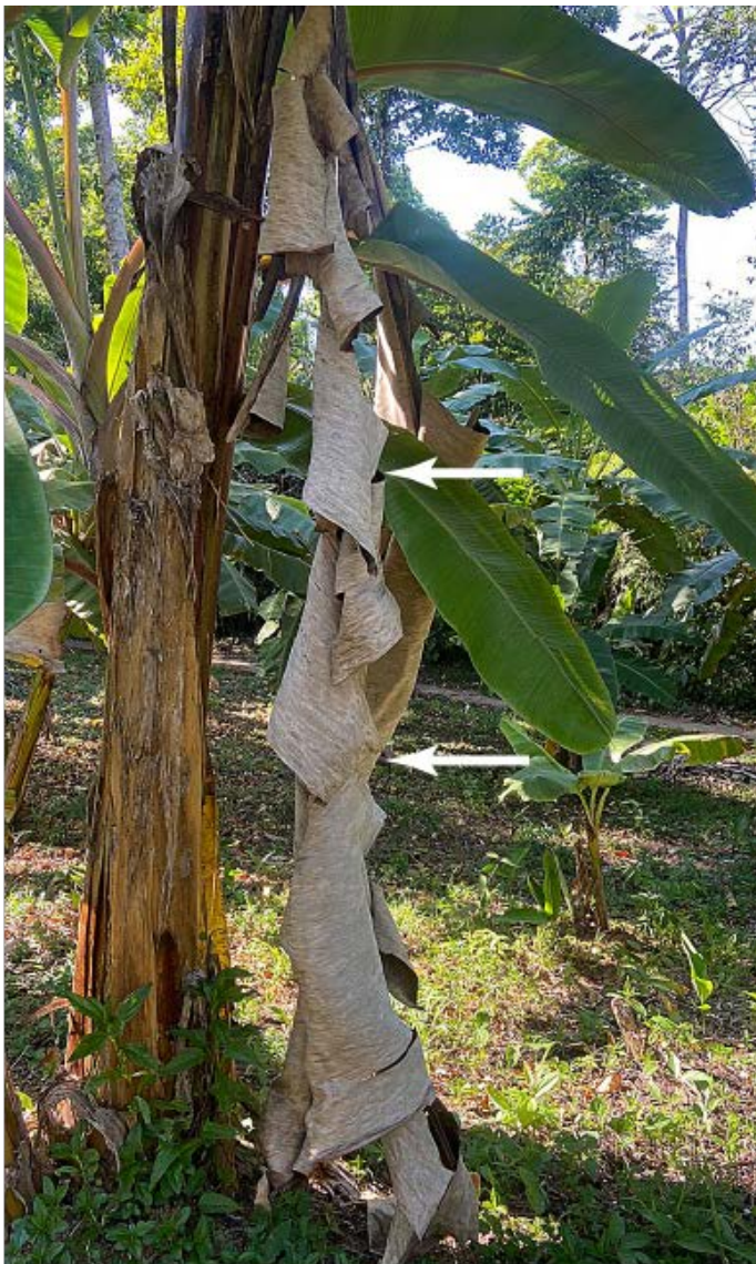
Figure 2. A “morado” banana (red banana in English, Musa acuminata ) in a patch that also includes plantains near La Paloma Lodge at Drake Bay, Puntarenas Province, Costa Rica. Portions of shredded dead leaves hanging from the trunk roll back on themselves to create dark, cone-shaped, roosting sites for bats. The top arrow points to where the colony of perhaps nine disk-winged bats, Thyroptera discifera , was observed roosting for more than a month during February–March 2021. The lower arrow shows where a single individual was found roosting for a single day. Photograph taken on 7 March 2021 by Gómez.

Roosting discifera were discovered by Gómez at a second site near La Paloma Lodge (8° 41' 40.8" N, -83° 40' 40.5" W) starting on 20 February 2021 and observed for over a month (Figure 2). The bats stayed in the same roost cone except that one individual was observed on 7 March 2021 in a lower cone formed from the same dead leaf and was assumed to have moved there from the colony above.