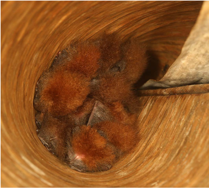
Figure 4. A colony of perhaps 9 Thyroptera discifera roosting in a portion of a dead banana leaf. This is the same plant identified in Figure 2 above and the bats were roosting in the top cone shown by the white arrow. Photograph taken near La Paloma Lodge, Drake Bay, Costa Rica on 4 November 2021.

neath dead banana leaves or inside shelters formed from such leaves. In areas where bananas are grown, it may be especially difficult to find discifera roosting in association with native plants. The finding of a wynneae inside a dead Cecropia leaf shelter similar to the dead banana leaf cones described here may indicate one sort of situation that discifera may be found in.